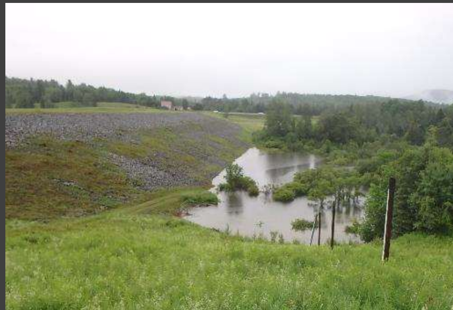
East Barre Dam