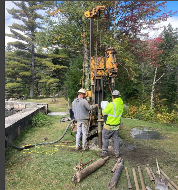
Noyes Pond Dam