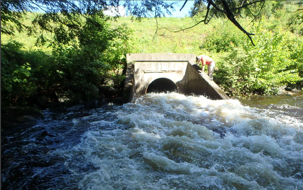
Gale Meadows Dam