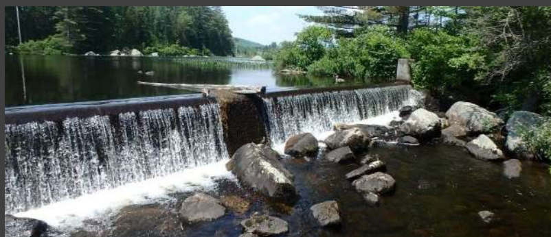
Lake Groton Dam

"The mission of the Vermont Dam Safety Program is to reduce risks to life, property, and the environment from dam incidents and dam failure through effective communication, education, regulation, and dam ownership"