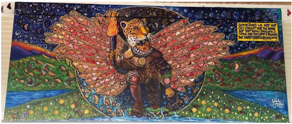
Juniper Creative Arts mural at Johnson Elementary School

The Vermont Arts Council supports public art through the Art in State Buildings program and our Arts Projects and Animating Infrastructure grant program. Animating Infrastructure Grants support community projects that integrate art with infrastructure improvements, demonstrating the positive impact that public art has in creating community cohesion and economic development. Recent projects have included a mural at the Johnson Elementary School created by Juniper Creative Arts and designed by students. Students engaged in conversations about belonging, representation, and community, and expressed that through co-created public art that reflects their experiences.