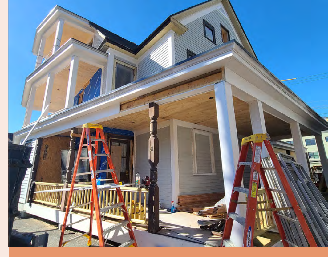
Recovery Housing: A Supportive Home Environment