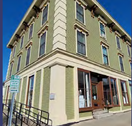
Clockwise from top: Molly Brook Farm Jerseys, Cabot Stimson Graves Senior Housing, Waterbury Albany General Store