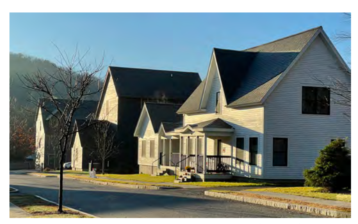
Twin Pines Housing added four homes this year at Safford Commons, a new neighborhood across from the high school in Woodstock.