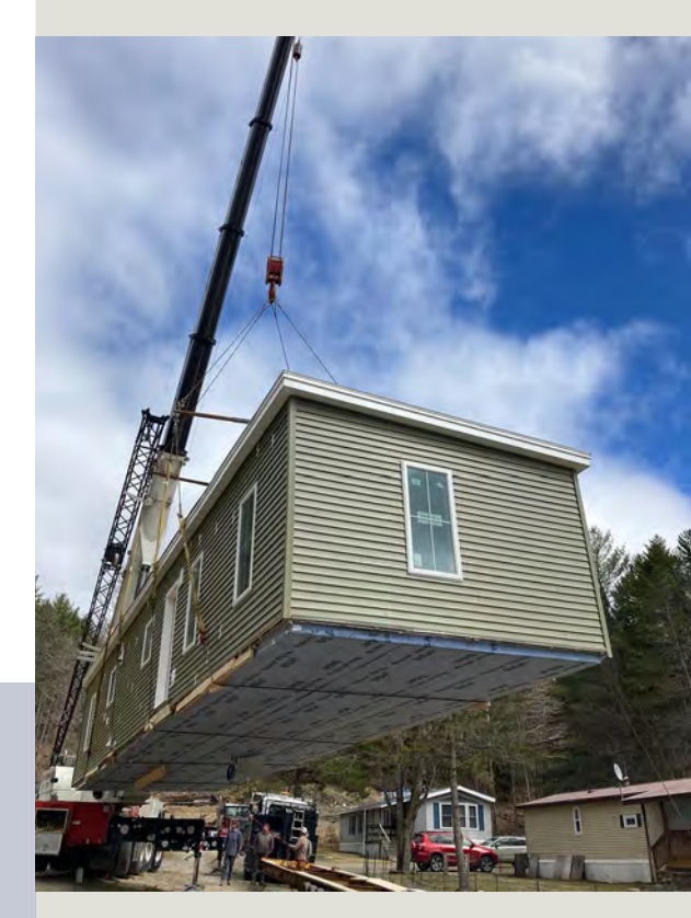
A zero-energy modular home being placed at Evergreen Mobile Home Park in Hardwick by the Lamoille Housing Partnership.

Energy efficiency standards for new and rehabilitated housing developed by VHCB and VHFA reduce operating costs across the state's portfolio of housing. Combined with advanced mechanical and renewable energy systems including cold climate air source heat pumps, biomass heating systems, and photovoltaic and solar domestic hot water systems, these investments are saving more than $2.4 million annually in energy costs and reducing greenhouse gas emissions by an estimated 8,100 tons annually.