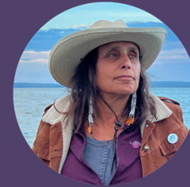
Keynote Speaker Winona LaDuke