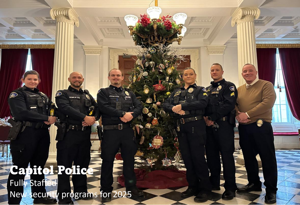
Capitol Police Fully Staffed New security programs for 2025