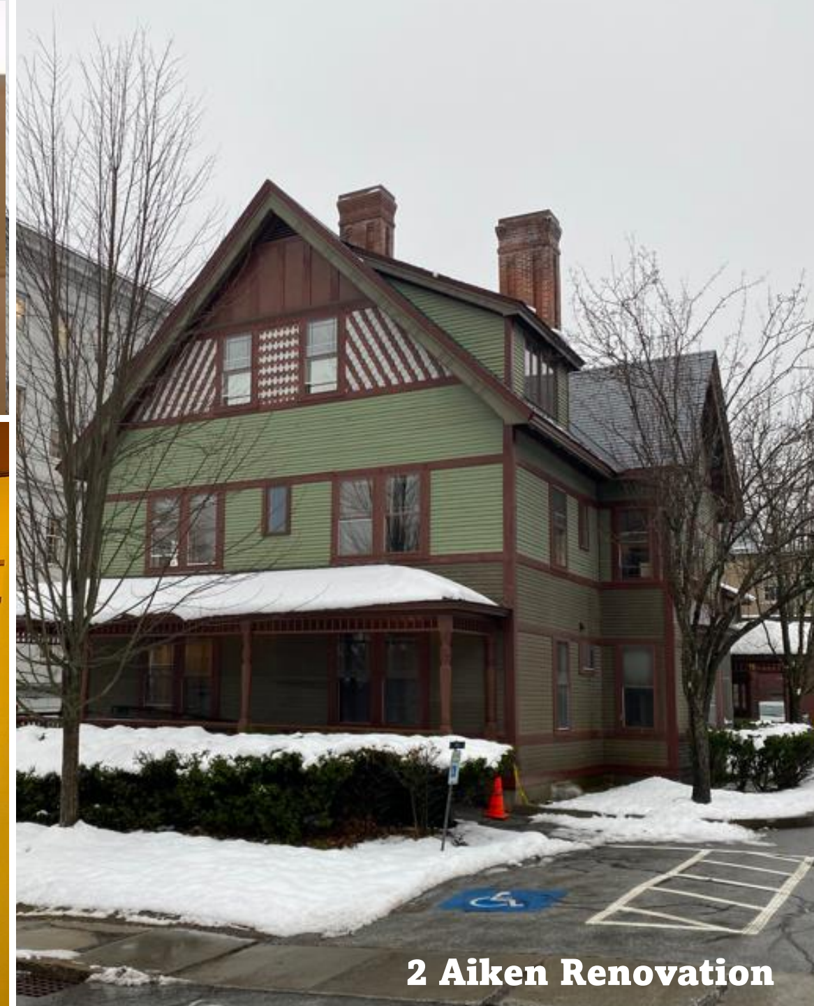
2 Aiken Renovation