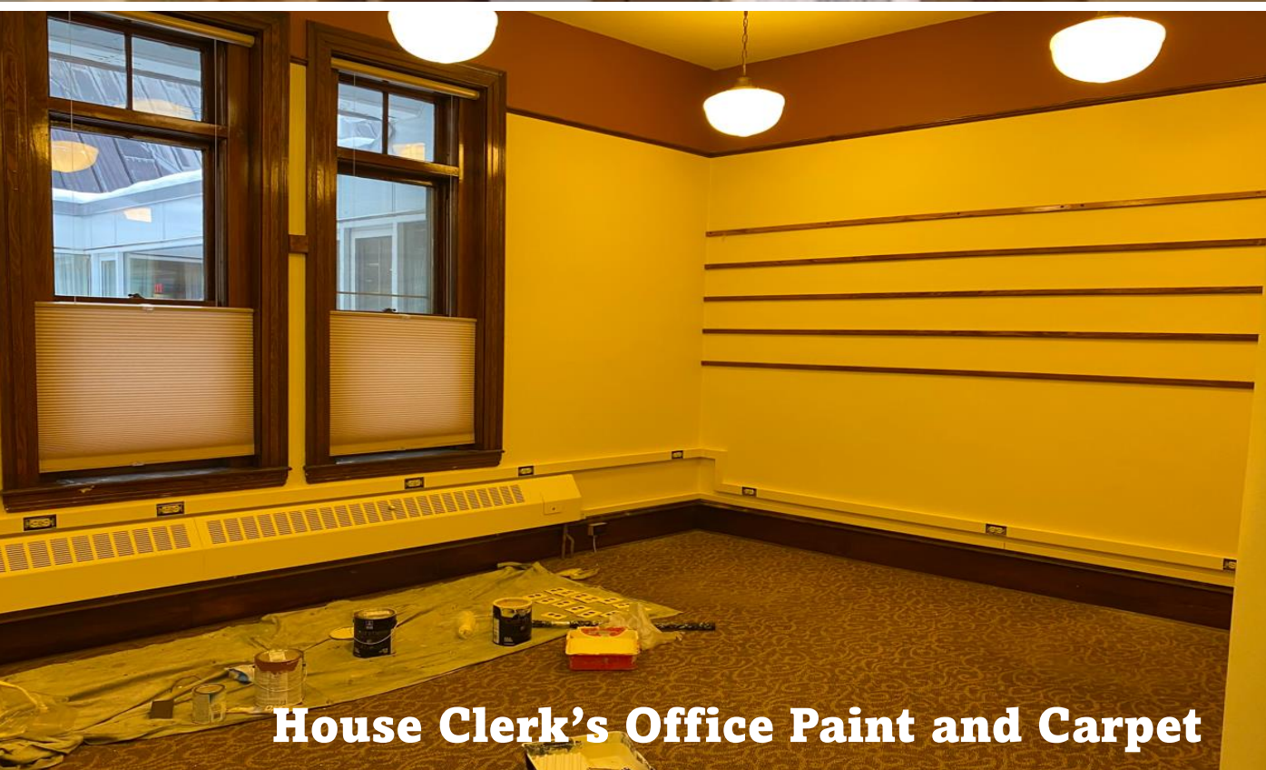
House Clerk's Office Paint and Carpet

IT Legislative Counsel Drafting Operations Legislative Operations Human Resources (partial) Joint Fiscal Office (partial) Chief of Police