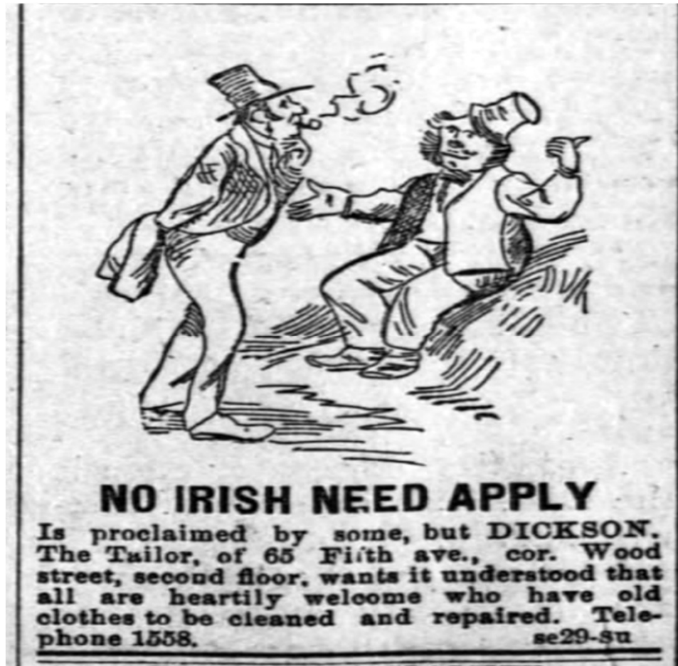
Anti-immigrant (Irish) attitudes, early 20 th Century, New York