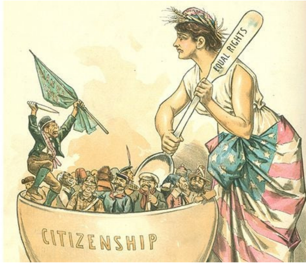
Harper's Weekly, 1889