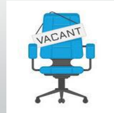
S/O User Support Specialist