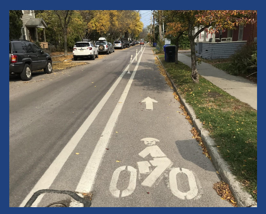
N. Union Street, Burlington