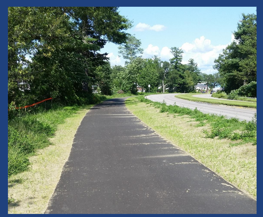
Shared use path along Route 15 in Colchester