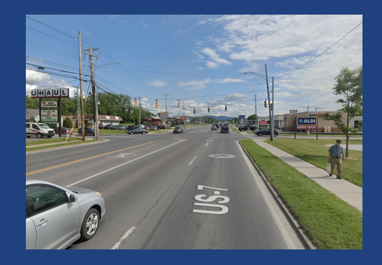
Route 7, Rutland Two people injured and one killed while walking within a quarter mile of this intersection between February and August 2022.