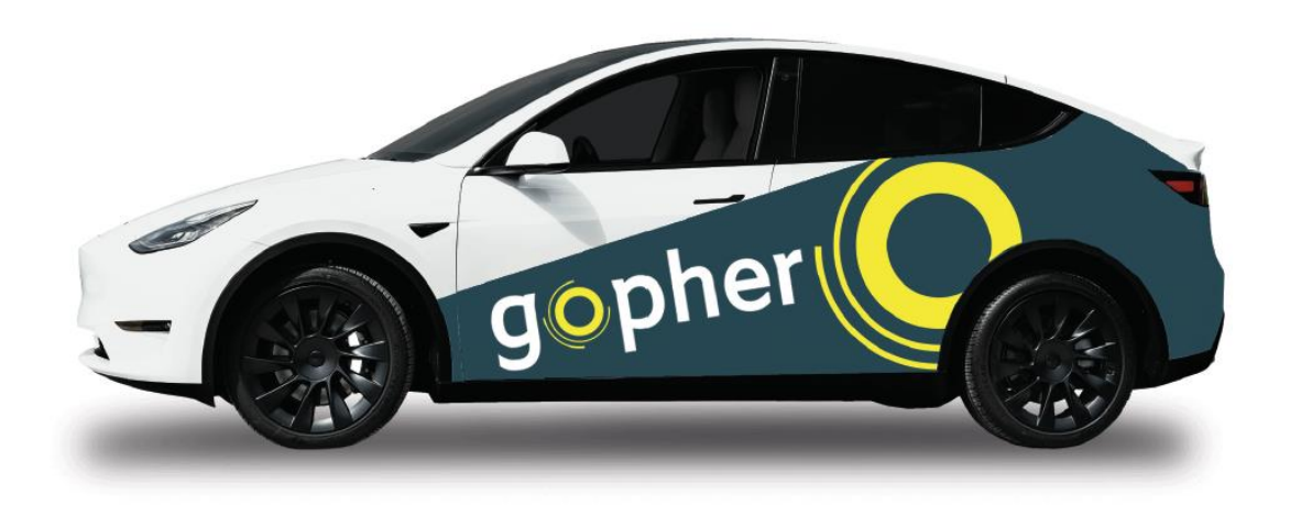
Need a ride...Gopher it!