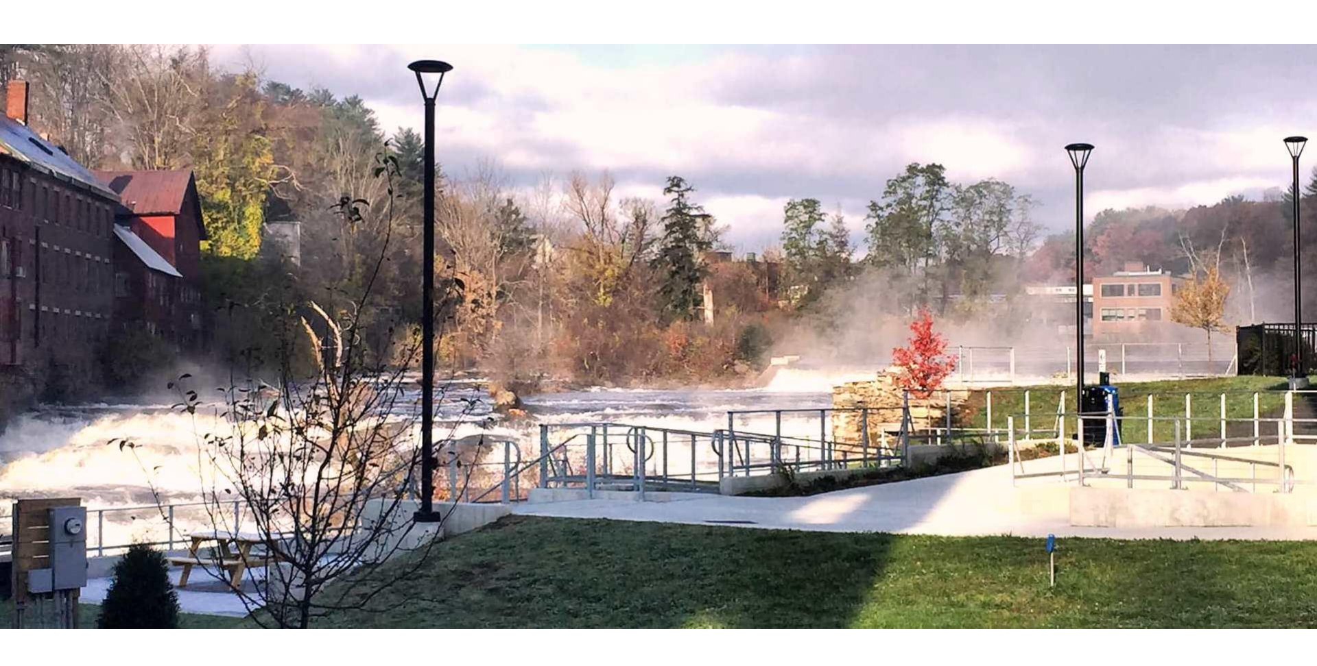
Springfield Comtu Falls Park After