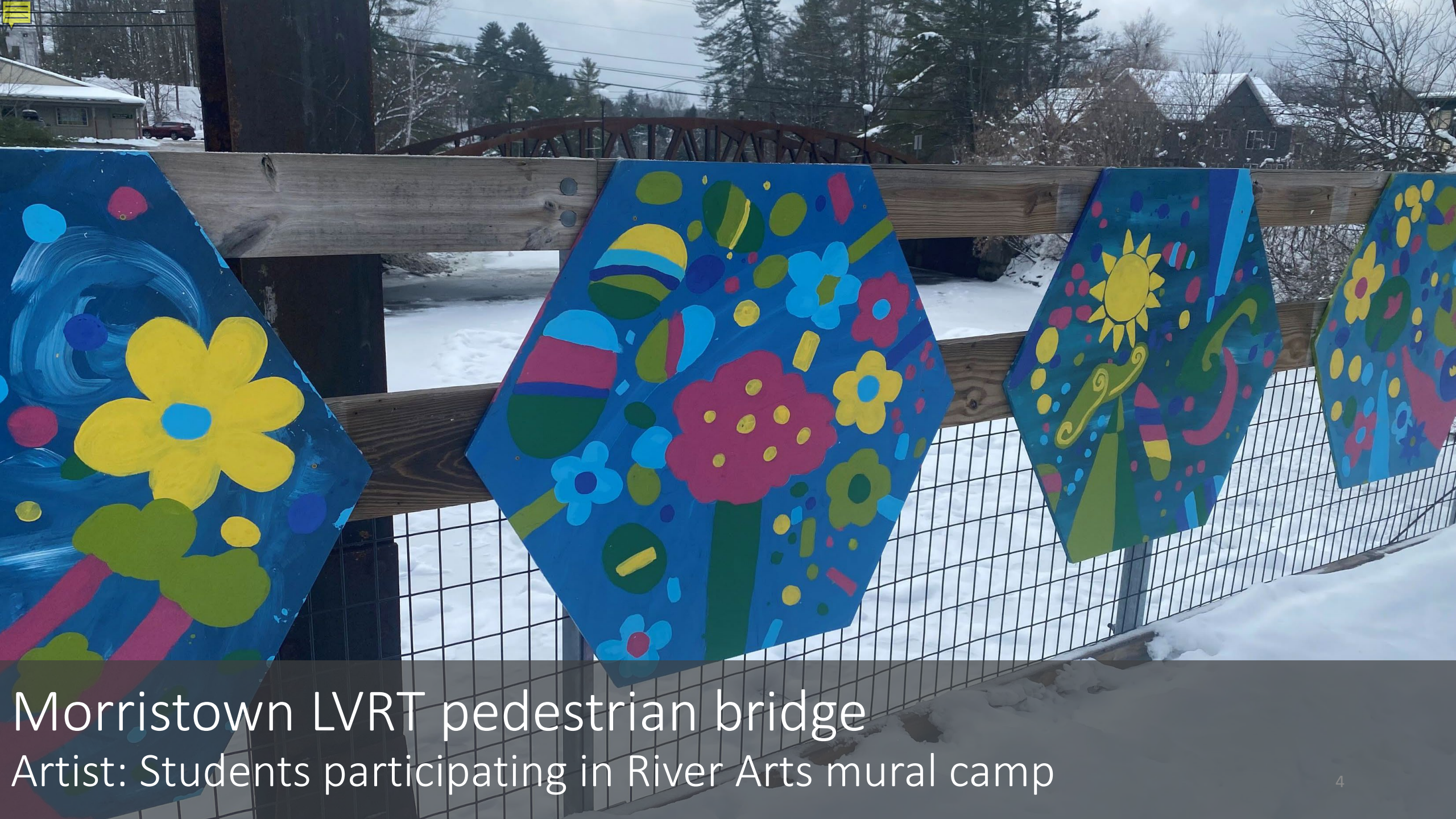
Morristown LVRT pedestrian bridge Artist: Students participating in River Arts mural camp