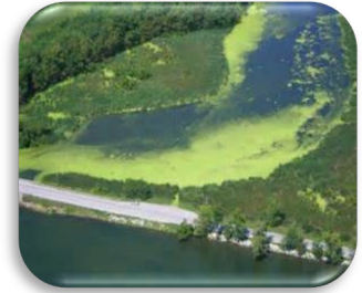
Photo: Algal Bloom