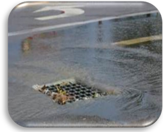
Photo: Road stormwater collection