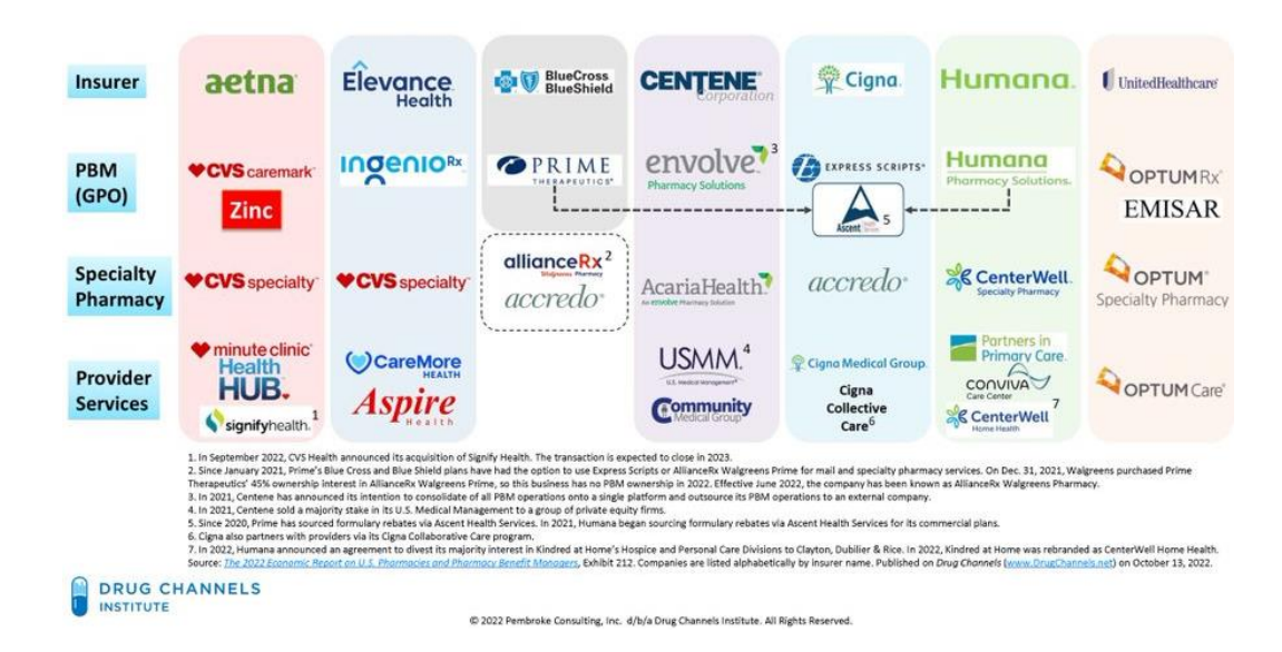
Figure 2, Vertical Business Relationships Among Insurers, PBMs, Specialty Pharmacies and Providers, 2022.

Because the health care sector is particularly vulnerable to anticompetitive effects from vertical consolidation, with extremely high costs and regulatory barriers to entry, federal regulators have expressed concern that mergers between PBMs and health insurers or PBMs and pharmacies will harm competition or patients by substantially lessening competition in the sale of PBM services or raise the cost of PBM services to health insurers.<sup>22</sup> Federal regulators have also expressed concern about the business practices enabled by vertical integration. On June 7, 2022, the Federal Trade Commission announced that it was launching an inquiry into the business practices of the six largest PBMs in the U.S., investigating: 1) fees and clawbacks charged to unaffiliated pharmacies; 2) steering patients to PBM owned or affiliated pharmacies; 3) auditing practices; 4) pharmacy reimbursement; 5) prior authorizations and other administrative restrictions; 6) specialty drug policies; and 7) the impact of rebates on formulary design.<sup>23</sup>