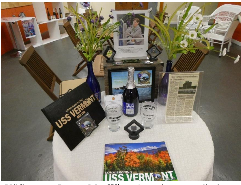
VSG partner Putney Mtn Winery's tasting room display