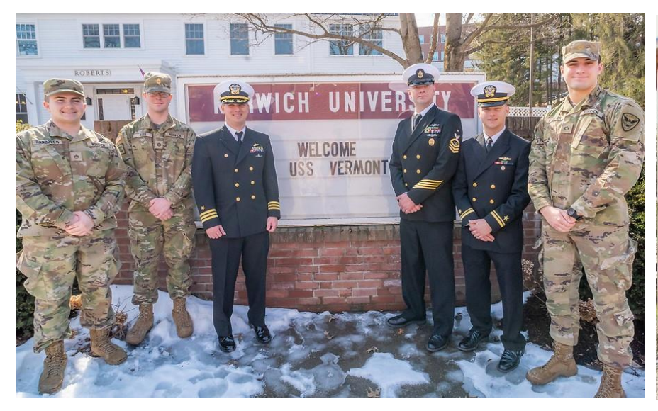
USS VERMONT Officers at Norwich University Vermont