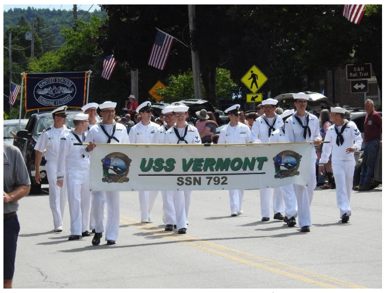
Our sailors marching in the Poultney 4<sup>th</sup> of July parade