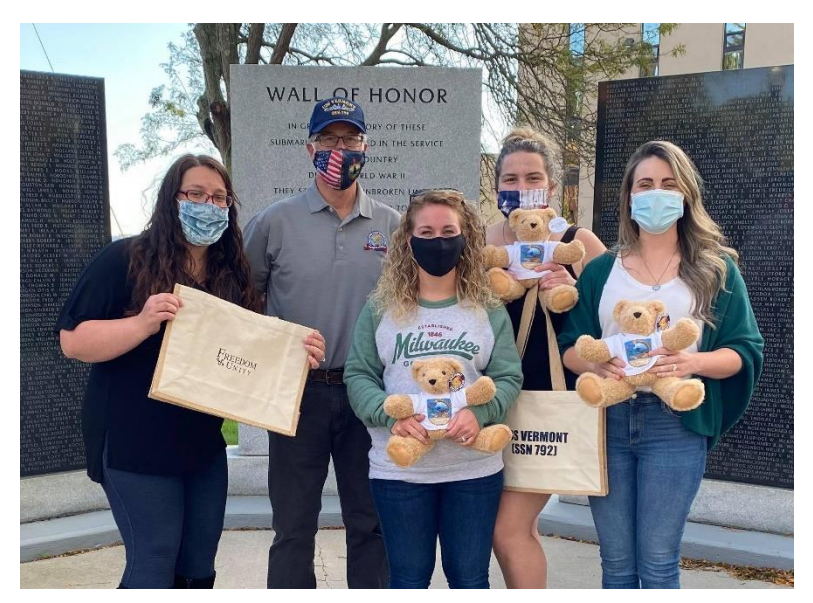
Delivery of Sunshine Bags, Vermont Teddy Bears, Maple Syrup, and "Tastes of Vermont" from VSFA to the FRG

Relationship with the Vermont Family Readiness Group (FRG)