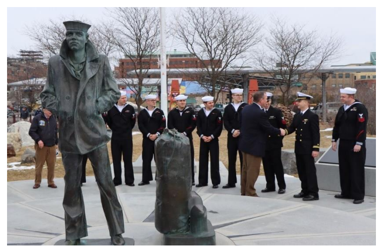
USS VERMONT sailors at LCNM