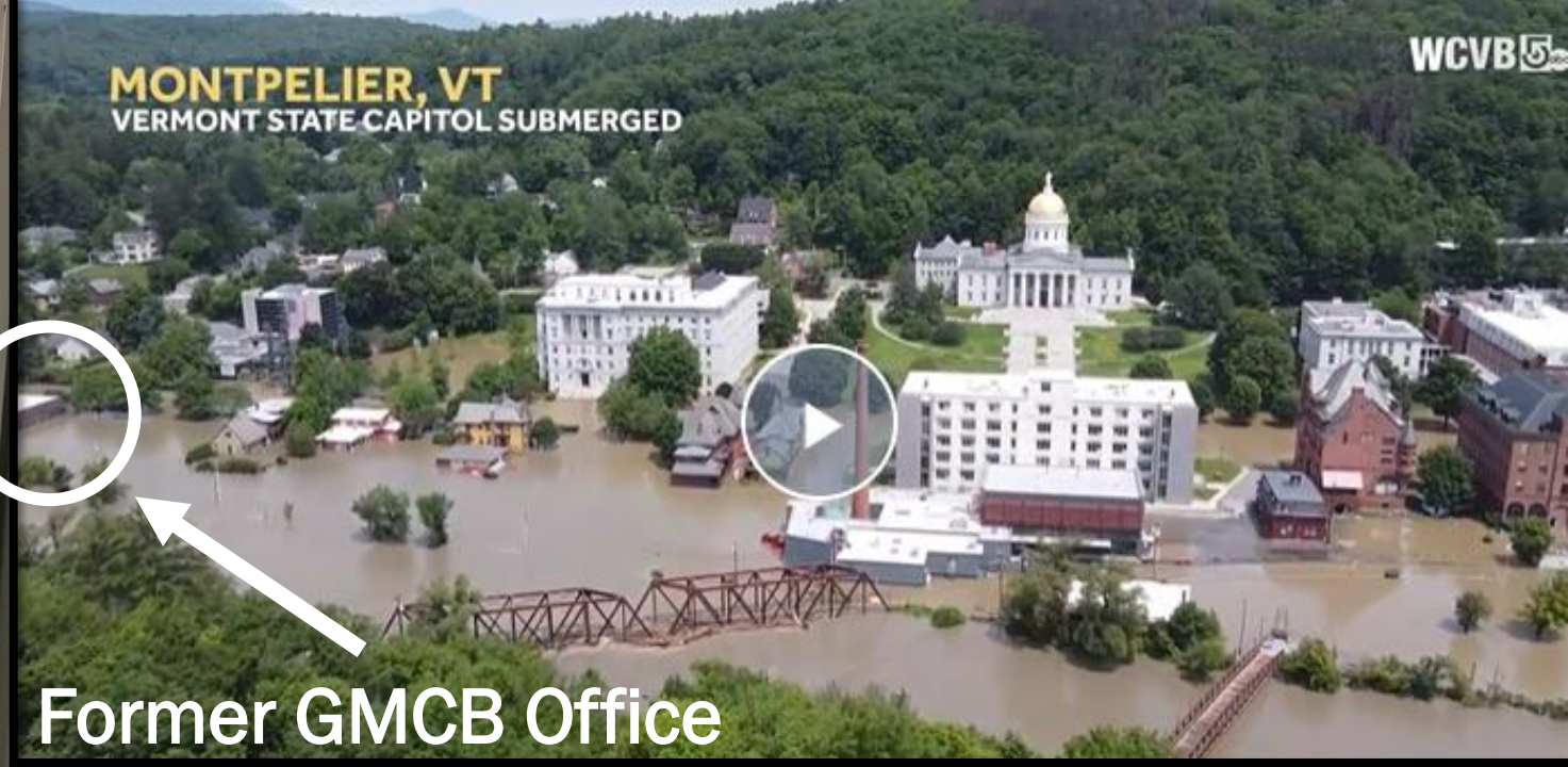
Former GMCB Office