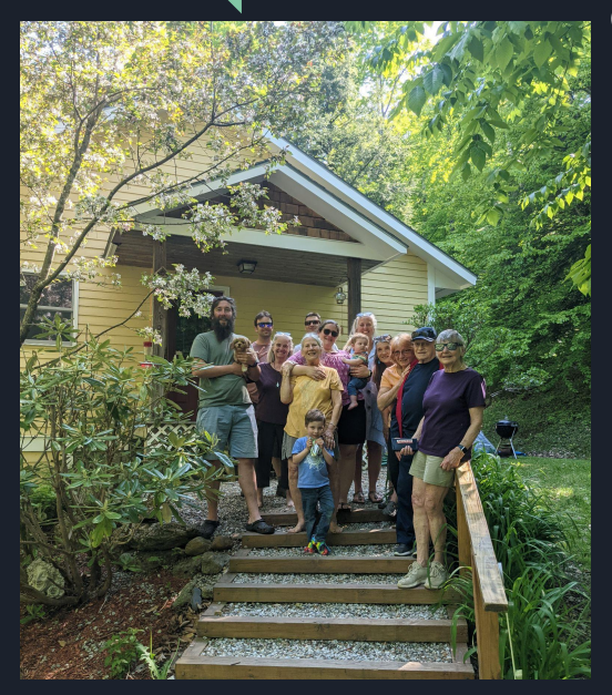
Quality, energy efficient, affordable homes