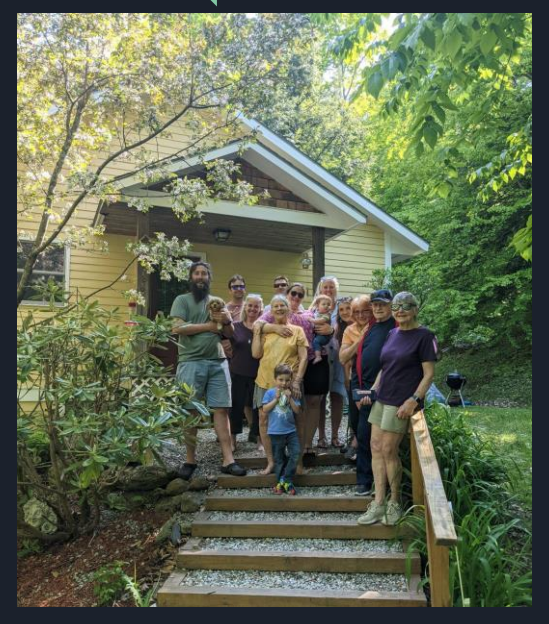
Quality, energy efficient, affordable homes