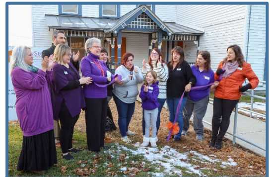
NewStory Center, Rutland City