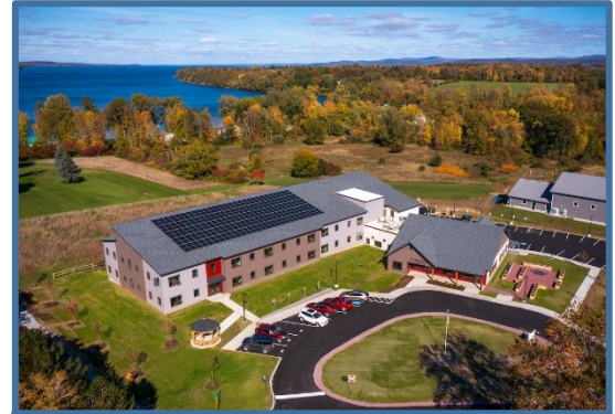
Bayview Crossing, South Hero