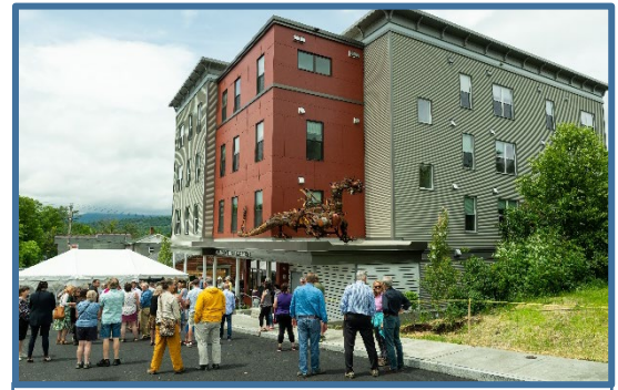
Village Center Apartments, Morrisville