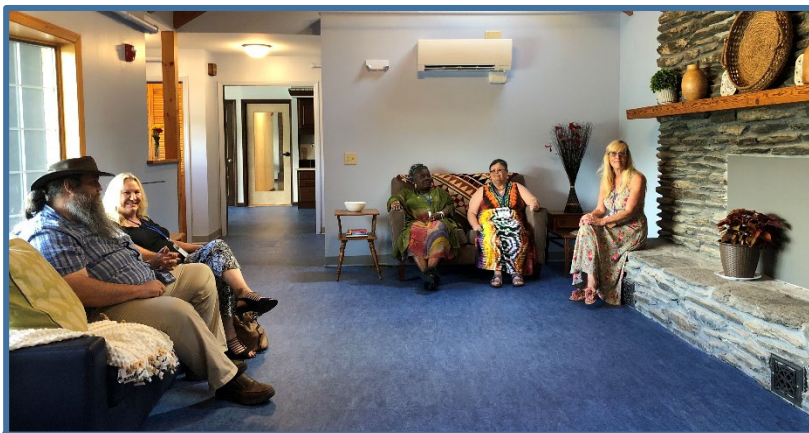
The Welcome Center, Berlin

The continued production of permanently affordable housing makes long-term housing possible for Vermonters exiting homelessness.