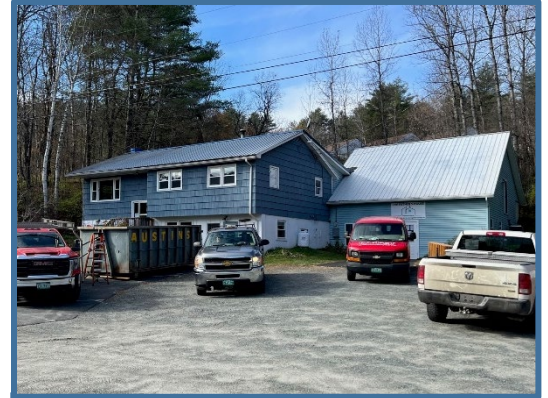
Moose River Shelter, St. Johnsbury

Since 2020, over 1,000 households experiencing homelessness have been housed through VHCB investment in new and existing units.