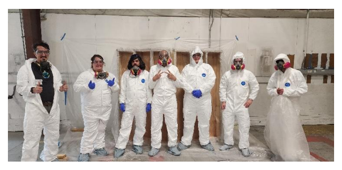
The ReSOURCE weatherization training intensive participants suited up for spray foam training. This course occurred in Bennington, VT.

To achieve these goals, we are also building more intentional relationships with state and community entities. SLE organizations bring the strongest