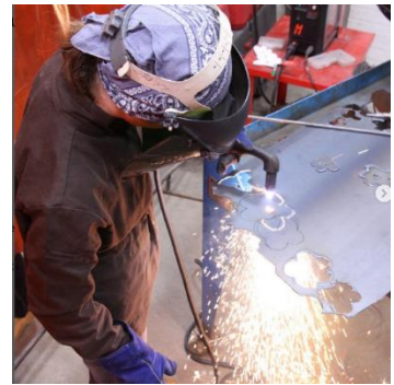
Twelve high school girls and gender-expansive individuals attended LIFT at the Center for Technology Essex for a week of trades exploration and hands-on learning in construction and welding.