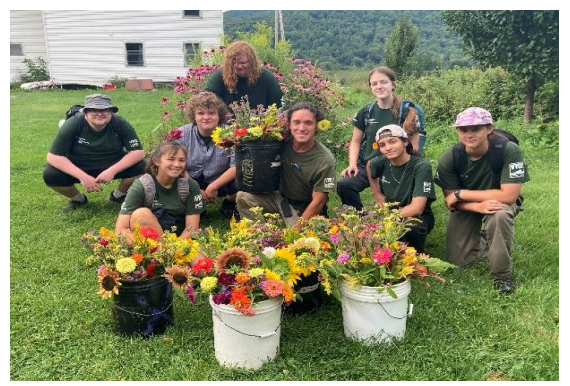
A VYCC farm crew with their fresh cut flower harvest. VYCC offered eggs and flowers for the first time this year in their Health Care Share program- providing fresh produce to over 500 families statewide.

The accomplishments in Appendix A reflect the priorities of organizations that are always working to find new and innovative solutions that support Vermonters. Each organization has made significant progress toward – and in some cases exceeded – program goals. This can be seen in the following summaries of organizational accomplishments.