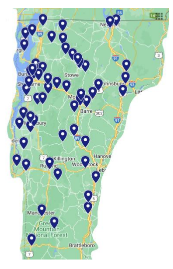
Map of service project locations for SLE programs July 2022-June 2023

We continue to see a demand for, and excitement about, our programs, and by working together we have been able to offer more positions than expected, increase compensation for participants, enhance trainings, and establish a growing network of private and public partners across the state. We would not be unable to do this