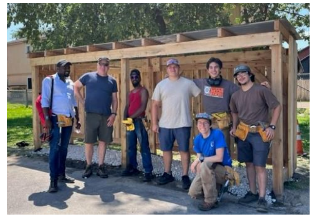
Construction 101 group from ReSOURCE completing an overhead structure for Champlain Housing Trust where trash and recycling cans will now be stored