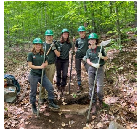
A VYCC conservation crew working on a stone staircase on Black Mountain in Dummerston, VT during June 2023. VYCC partnered with the Nature Conservancy on this project.

To improve the corps experience, VYCC invested in residential infrastructure on campus with improved lean-tos, increased access to internet, new charging stations and water access in camping areas. A multi-year campaign to renovate the East Monitor Barn began this year and will lead to dramatically increased access to on-campus housing, improved program-specific facilities, as well as a brand-new construction-trades workshop.