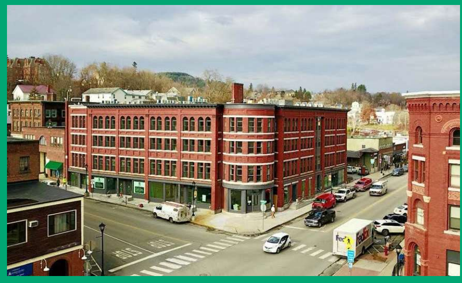
New Avenue, St. Johnsbury