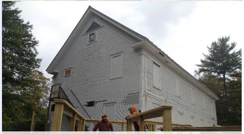
North Calais Memorial Hall (Received $222,000 NBRC Grant with REDI support)