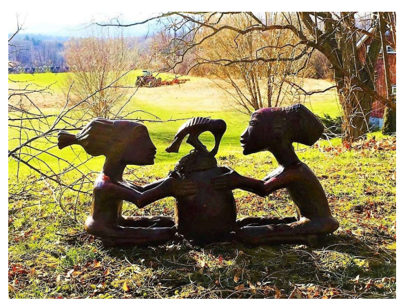
Clemmons Family Farm, Charlotte