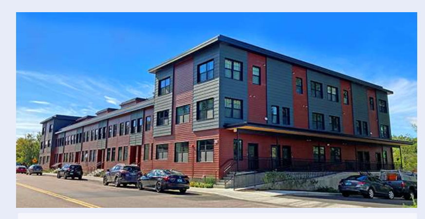
Butternut Grove Condominiums, Winooski