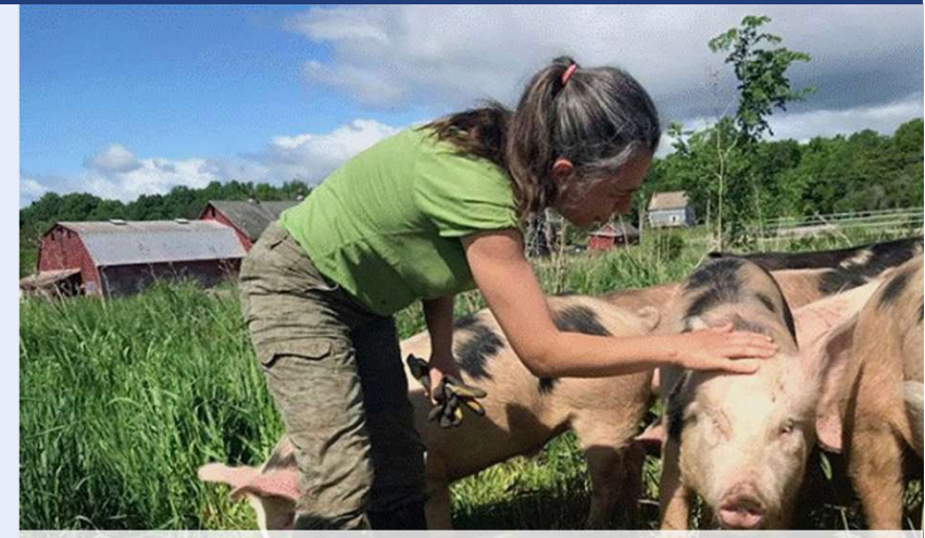
Agricola Farm, Panton (Recieved $204,000 VAPG with REDI support)