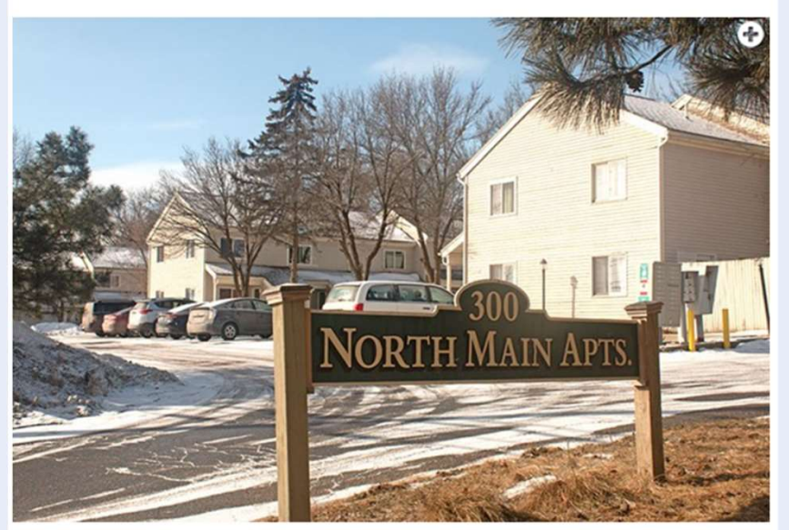
300 North Main apartments

Published February 16, 2022 at 10:00 a.m. I Updated March 7, 2022 at 6:34 p.m.