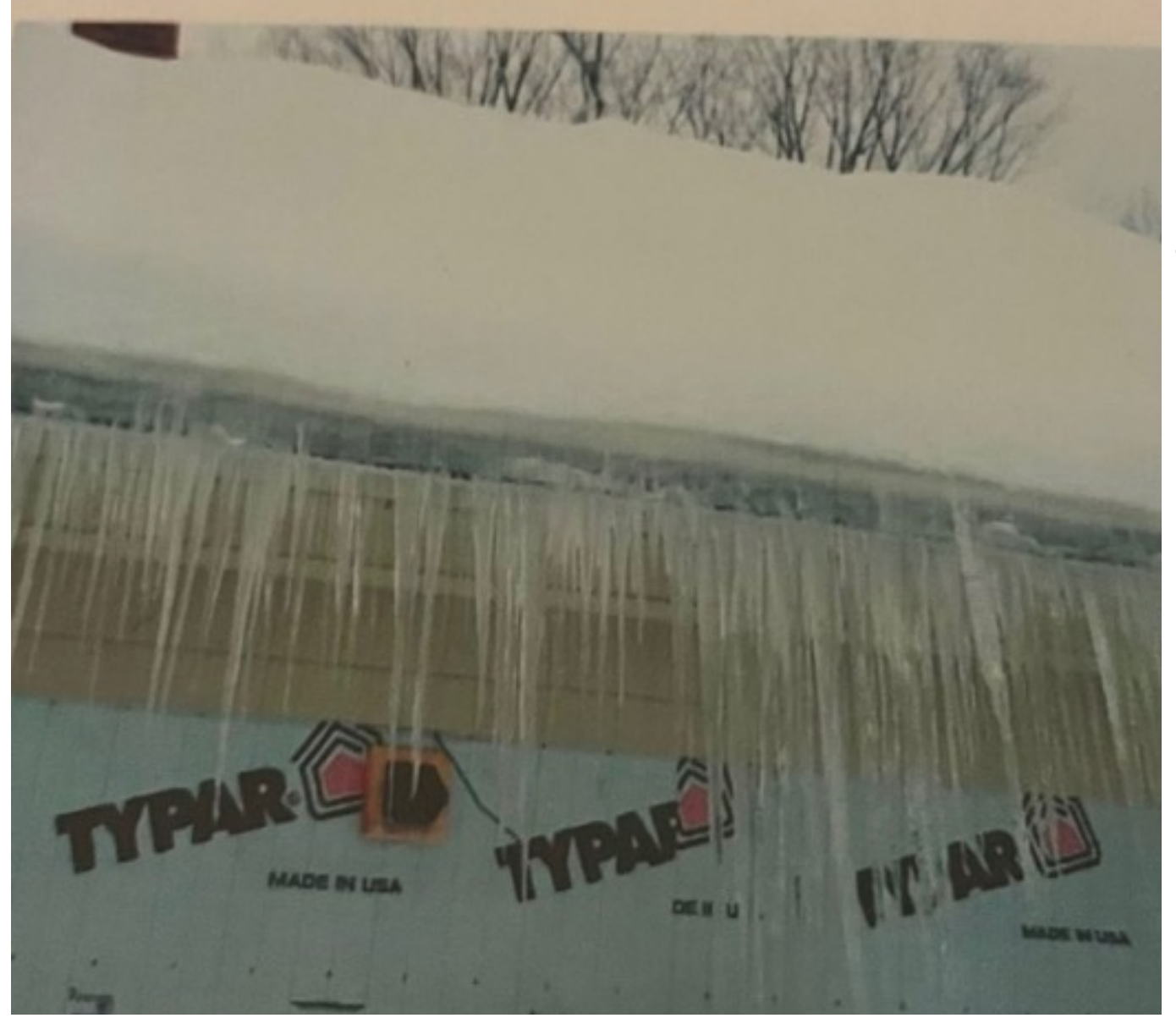
Act 47 Building Energy Code Study Committee report, 12/1/23