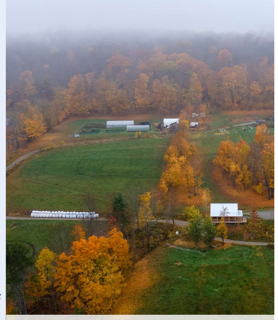
Rebop Farm, Brattleboro

• Since 2017, $525,000 in REDI funds has helped secure more than $10M in grants for businesses & communities