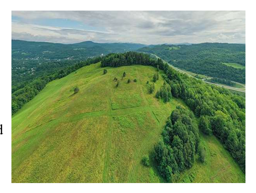
Observatory Knob St. Johnsbury, Vermont