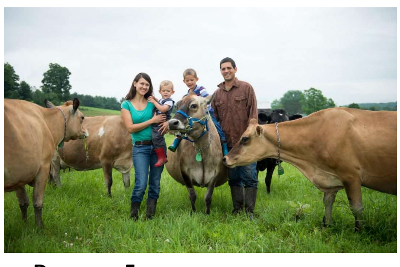
Donegan Farm Hinesburg and Charlotte, VT

Develop and adopt a statewide conservation plan, in order to: