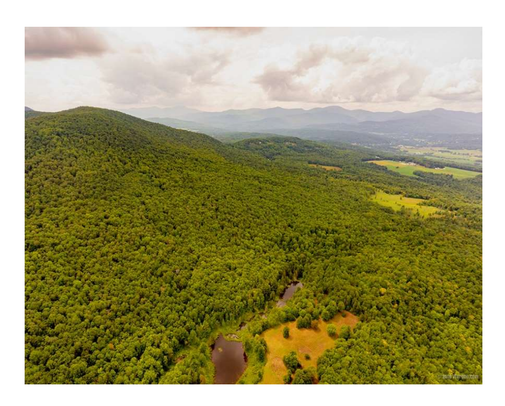
Brownsville Forest, Stowe, Vermont

Working with conservation partners, public land managers, and public stakeholders