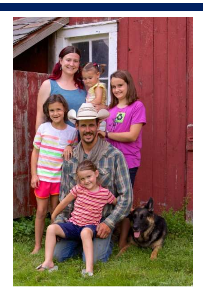
Hughs-Muse Farm Pawlet, VT