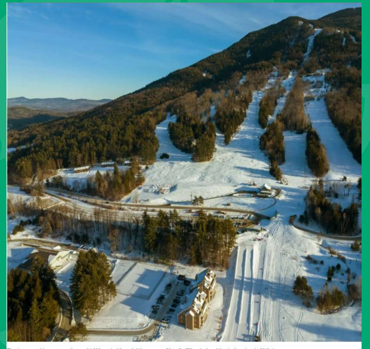
The Ascutney ski resort once boasted 1,800 vertical feet of skiing on over 50 trails. When it closed for the last time in 2010, it was a crushing blow to the town of West Windsor.