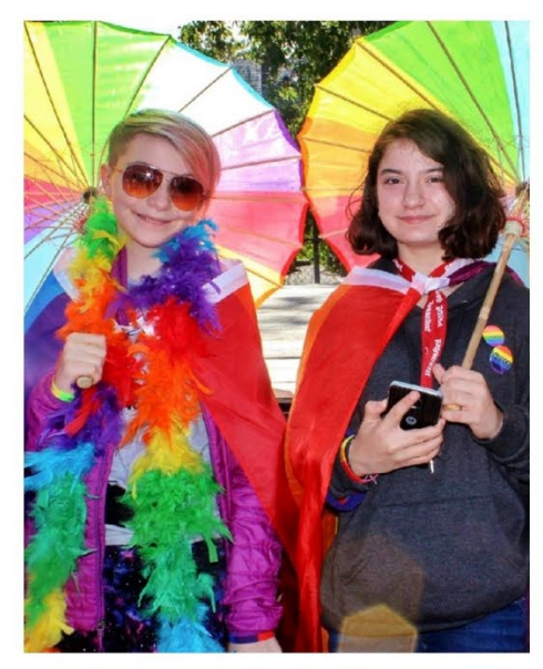
DISCOVERING SELF AND SUPPORTIVE PEER CONNECTIONS