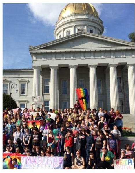
TRANSFORMING SCHOOLS, COMMUNITIES, AND SYSTEMS