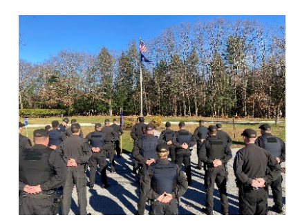
Recruits at Flag Call.

The following are the individual reports for the Police and Fire Academies as submitted by both agencies. The report reflects training related injuries from January 1, 2023 through December 31, 2023. The individual report includes current injury reporting data, explanation of injuries, and the mitigation measures employed to prevent future injuries. The Safety Committee met periodically throughout the year to review past and future program deliveries to ensure best safety practices are in place.