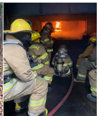
Fire Officer students developing fire investigation skills.