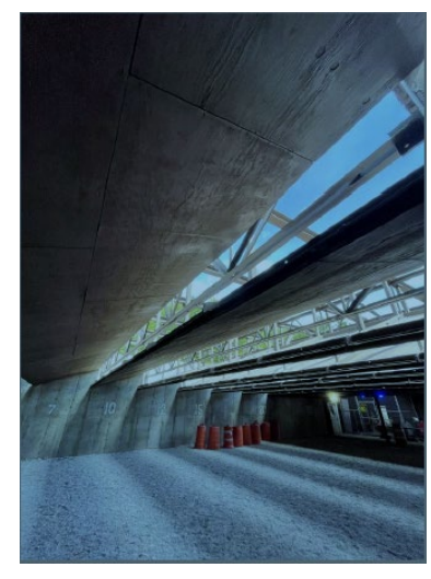
The Small Arms Range is uncovered and fills with ice and snow in the winter months.

In 2021 the legislature allocated $50,000 in capital funding for a two-part study to address safety issues within two separate buildings. The first part of the study was to determine if a roof can be installed over the small arms range to eliminate ice accumulation that occurs in the winter months and to suggest a design and provide a cost estimate for a new roof system. The second part of the study assessed the interior spaces within the Main Building, Gym, and West Cottages to determine if existing spaces can be reconfigured to meet current use needs. These projects were completed late in 2022 and the reports are currently being reviewed and analyzed by the Department of Buildings and General Services and the Governance Committee. Part of the analysis includes updates to the gym to reduce condensation on the floor during summer months.