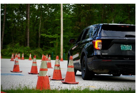
Recruit driving on the driving pad.