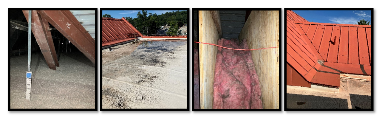
The project is currently in the planning phase. Funding in this biennium should bring the project through construction.

The 20,136 sq ft Brattleboro Courthouse is critical to court operations in the Windham County region. The complex roof system has reached the end of its useful life and is showing signs of accelerated deterioration with the development of several known water leaks. Water leaks allow for water infiltration which may result in water damage and mold growth compromising the health of the building occupants. BGS has continued to maintain and patch the roof to prevent water infiltration, but the leaks are occurring more frequently and have become more widespread which is an indicator that the roof requires replacement. The primary objective of this project is to remove the existing roofing materials and design a replacement roof which includes two entry points that will be added for maintenance access to the roof drains located on the northern flat roofs. This improved maintenance access will help to ensure a longer life for the new installation. Additional insulation and energy efficiency improvements will also be considered as part of the project.