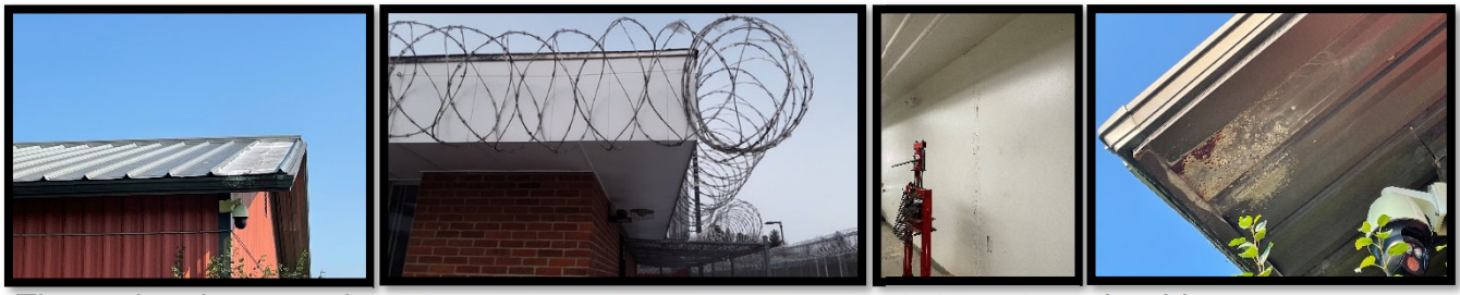
The project is currently in the design phase. Funding in this biennium should bring the project to construction completion.

The scope of this project includes major repair and replacement of roofs throughout the facility including E-Wing, D-Wing, kitchen, and administration asphalt shingled roofs, replacement of one ballast roof over old infirmary, improvement of roof insulation to meet current energy code, repair of the brick in the great wall and its cap, repair of the brick wall between the gymnasium and old maintenance shop roofs, repair of the generator building roof, repair of the wood shop standing seam roof and interior damage, and repair of the hedge house roof between the two greenhouses.