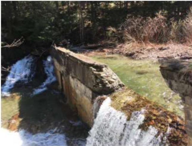
Before removal of Camp Wihakowi dam on Bull Run river in Northfield, VT.