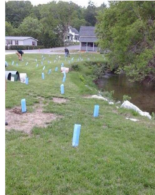
Re-establishing protective tree cover on the banks of the Neshobe River