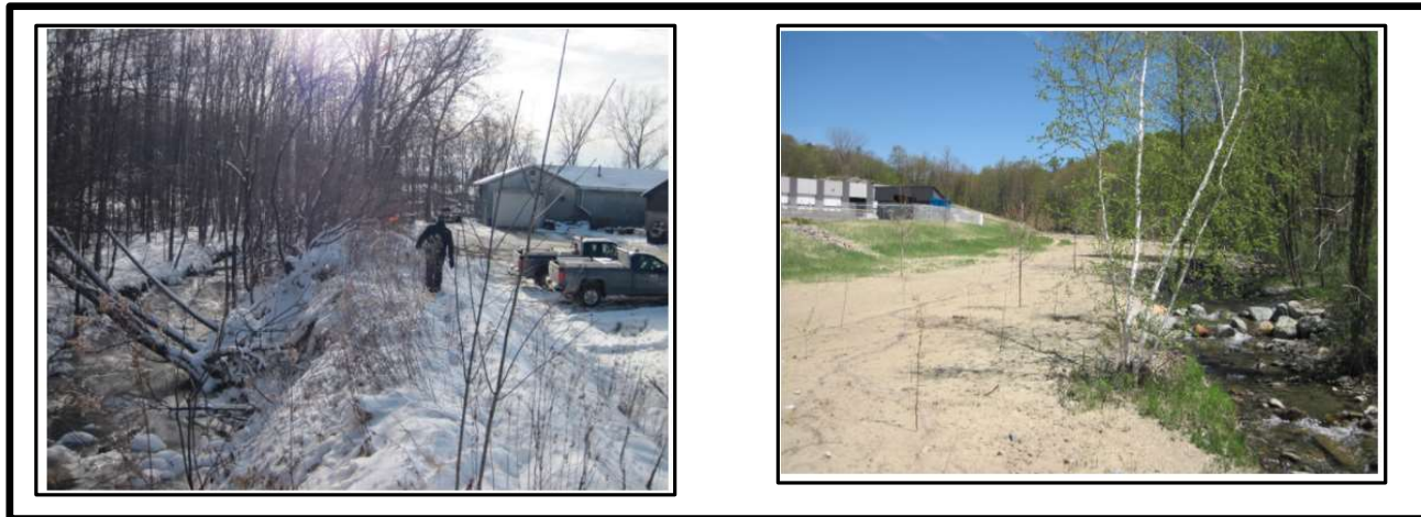
Beecher Hill Brook Floodplain Reconstruction – Before and After