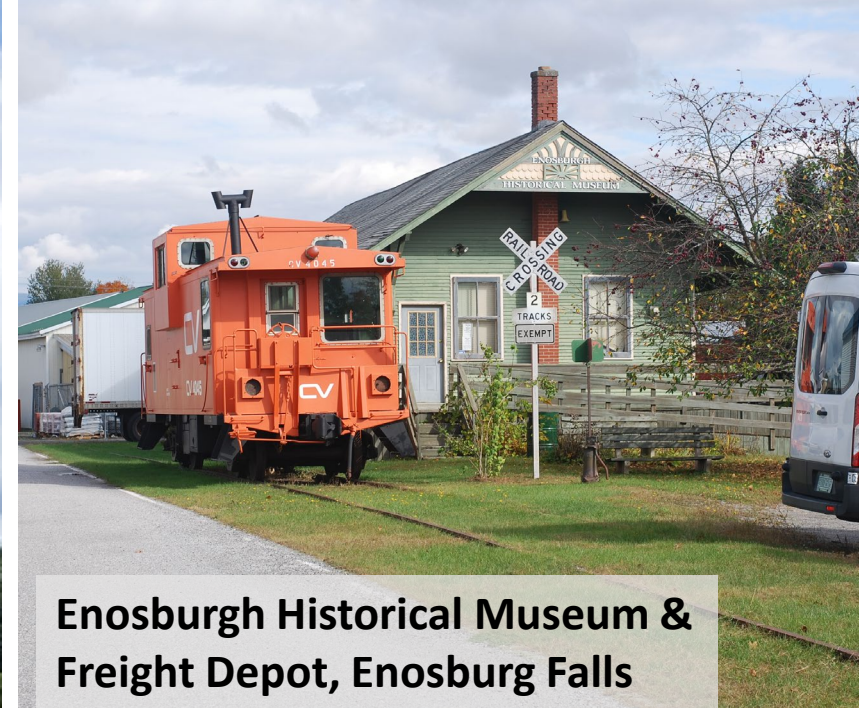
Enosburgh Historical Museum & Freight Depot, Enosburgh Falls