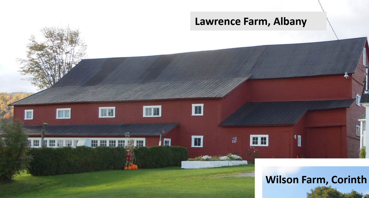
Lawrence Farm, Albany