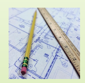
Aug. 2025 Design Development