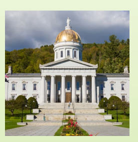
June 2027 Construction Completion