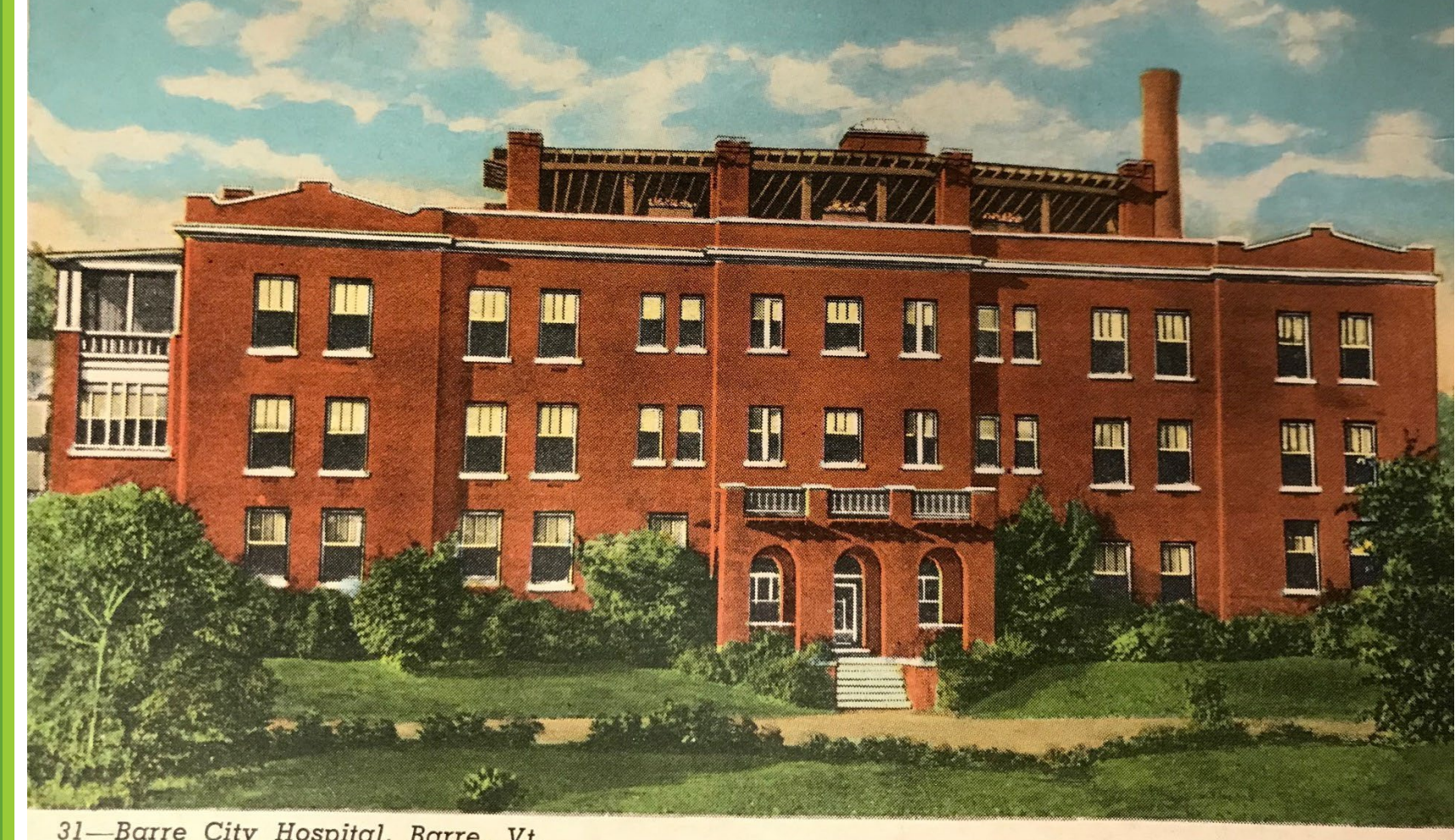
31—Barre City Hospital, Barre, Vt.

Project challenges: Roof is actively leaking, emergency repairs were made on a temporary basis. Coordination with removal of rooftop HVAC equipment is required.