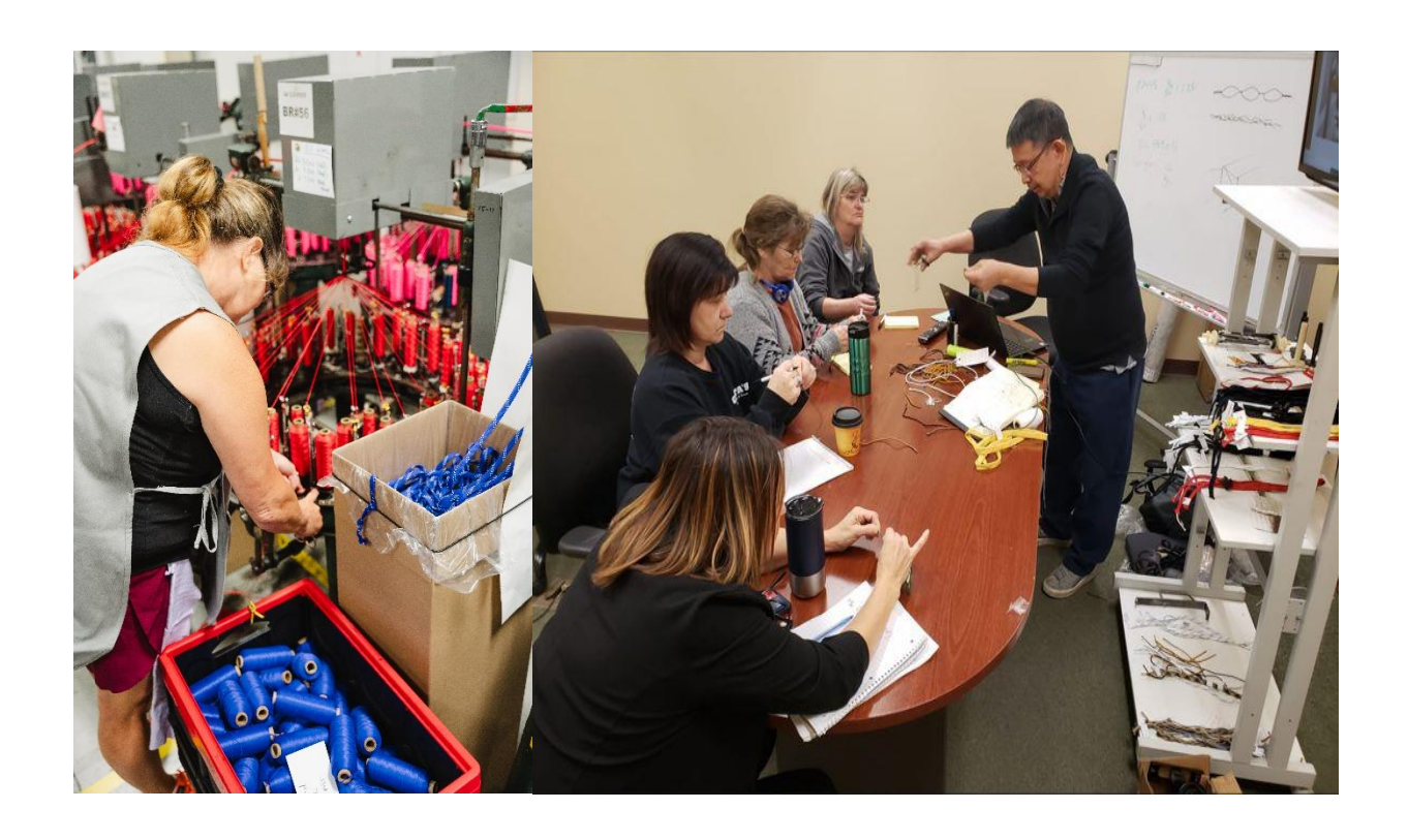
Image Caption: Employees working on commercial knitting machines and training in a classroom around a table.

Grant Details: Calko Group (Green Mountain Knitting) moved their Vermont facility from Milton to Richford and needed to train many new employees to be able to operate their commercial knitting machines.