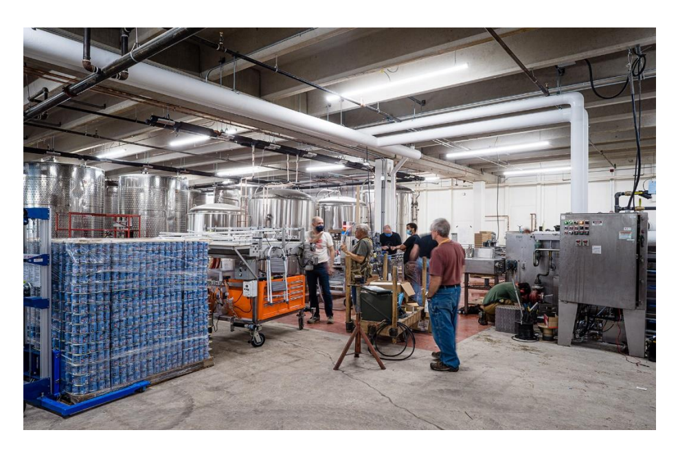
Image Caption: Employees operating a canning machine at Shacksbury Cider production facility.

Grant details: Received training funds to train workforce in contract packaging including quality control and efficiencies supporting Vermont's craft beverage industry sector.