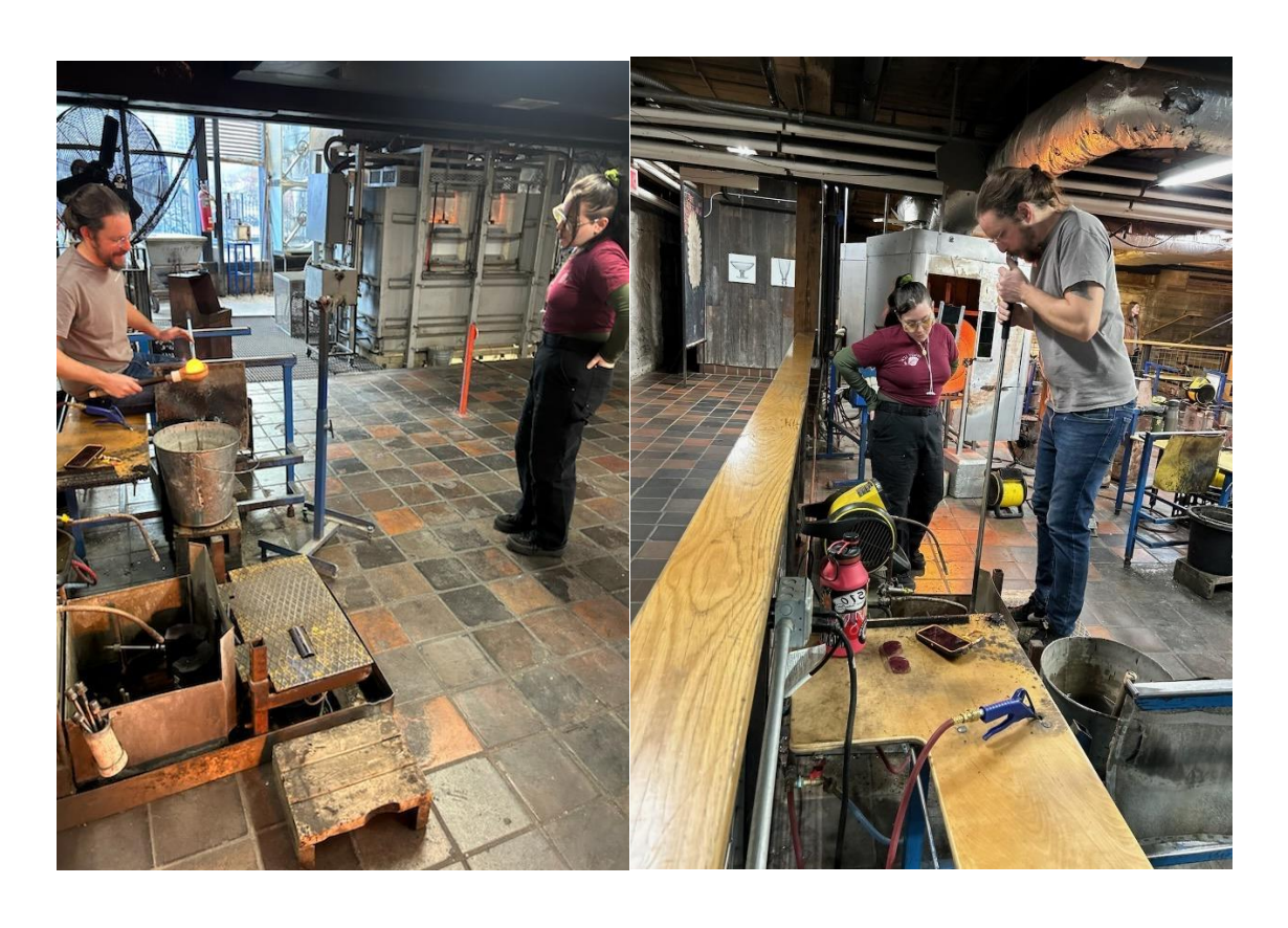
Image Caption : Attached are pictures of a Master Glassmaker demonstrating to a Glass Associate Journeyman how to shape a hot gather of glass (pic1) and how to blow glass in a mold (pic 2).

Grant Details: VTP assisted with funding for the training of 25 glass blowing apprentices as Simon Pearce expands their Windsor facility to increase the size of the glass floor.