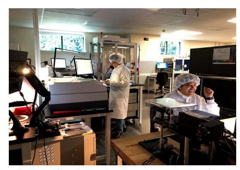
Image Caption: Two manufacturing workers in a clean room manufacturing workplace.

Grant Details: Chroma increased its workforce by 60%. As production increased, they utilized VTP for manufacturing training as well as leadership for their incumbent and new leaders.