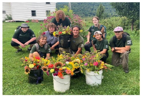
A VYCC farm crew with their fresh cut flower harvest. VYCC offered eggs and flowers for the first time this year in their Health Care Share program- providing fresh produce to over 500 families statewide.

The accomplishments in Appendix A reflect the priorities of organizations that are always working to find new and innovative solutions that support Vermonters. Each organization has made significant progress toward – and in some cases exceeded – program goals. This can be seen in the following summaries of organizational accomplishments.