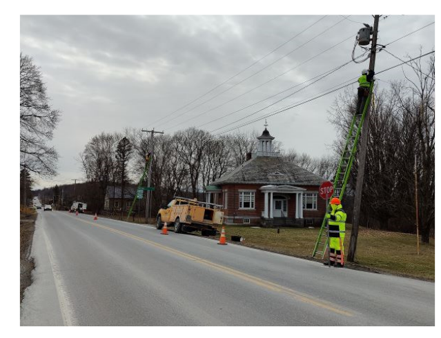
Maple Broadband Connects a customer