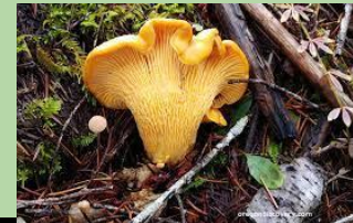
Pacific Golden Chanterelle