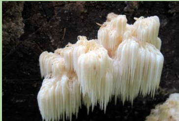
Bear's Head Tooth