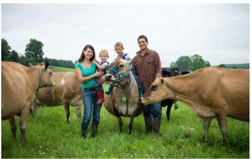
Donegan Farm Hinesburg and Charlotte, VT

Develop and adopt a statewide conservation plan, in order to: