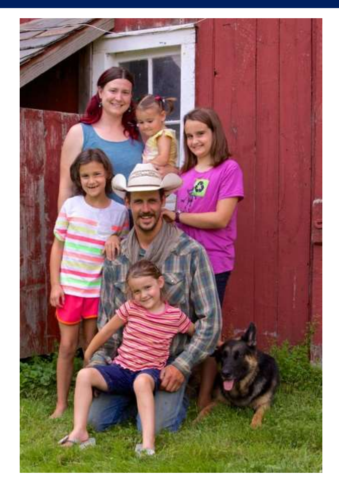
Hughs-Muse Farm Pawlet, VT