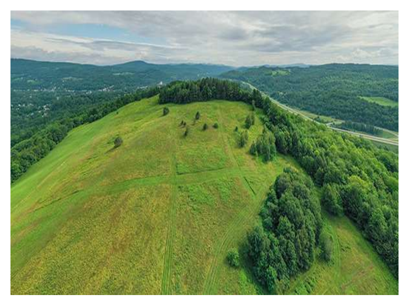
Observatory Knob St. Johnsbury, Vermont