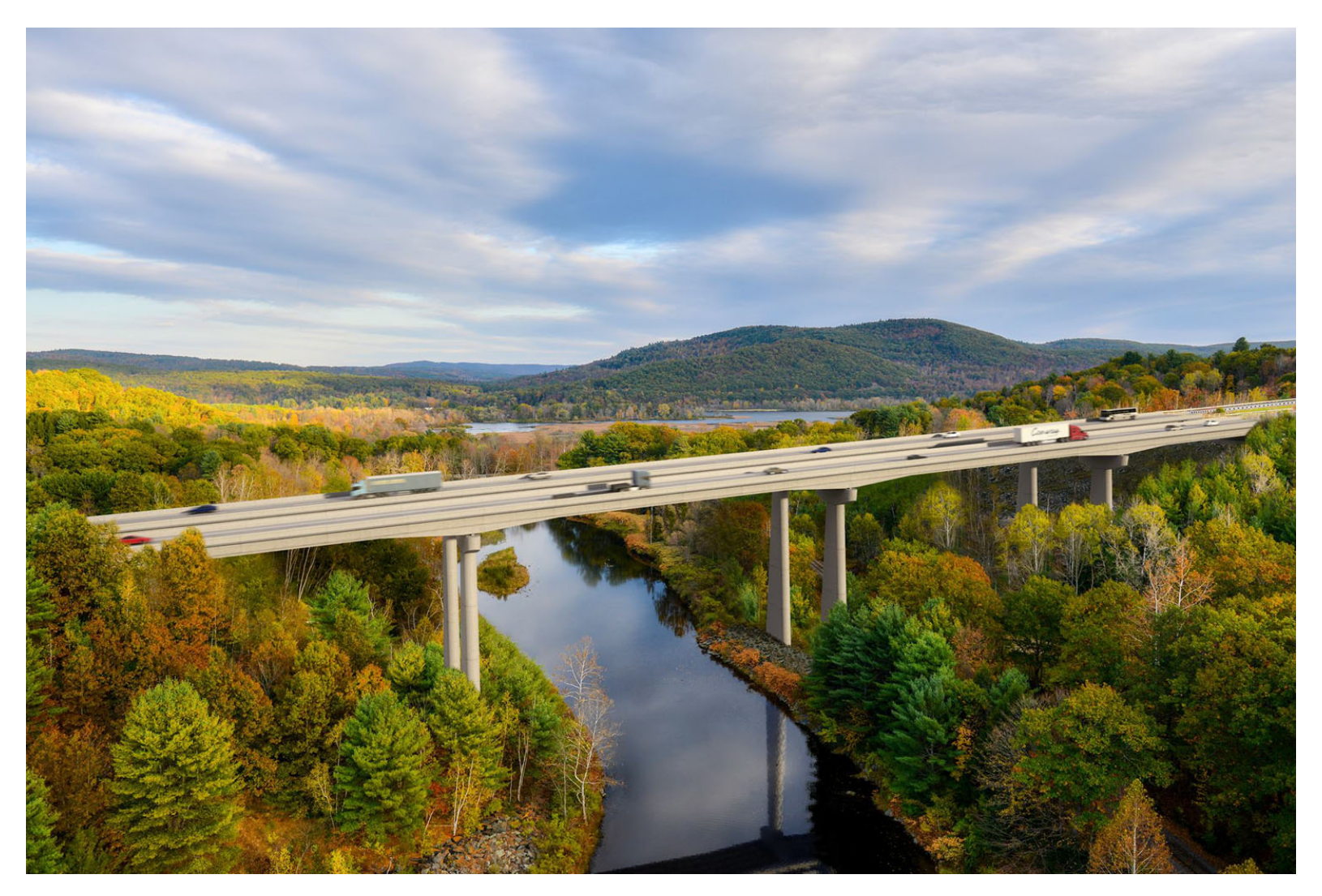
Rockingham I-91 Bridges 24N and 24S - IM 091-1(66) (pci.org)