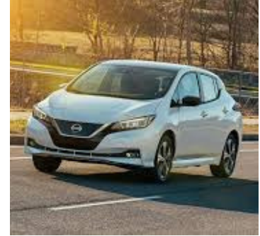
like the Nissan Leaf

"The MileageSmart program gave me the opportunity to get a newer car within my price range. This will hopefully result in more secure transportation for a longer time. It was an efficient, straight forward process. I am happy to get great gas mileage, too!"