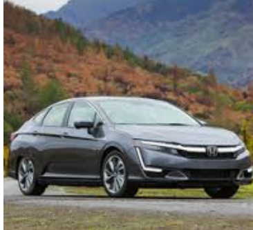
like the Honda Clarity