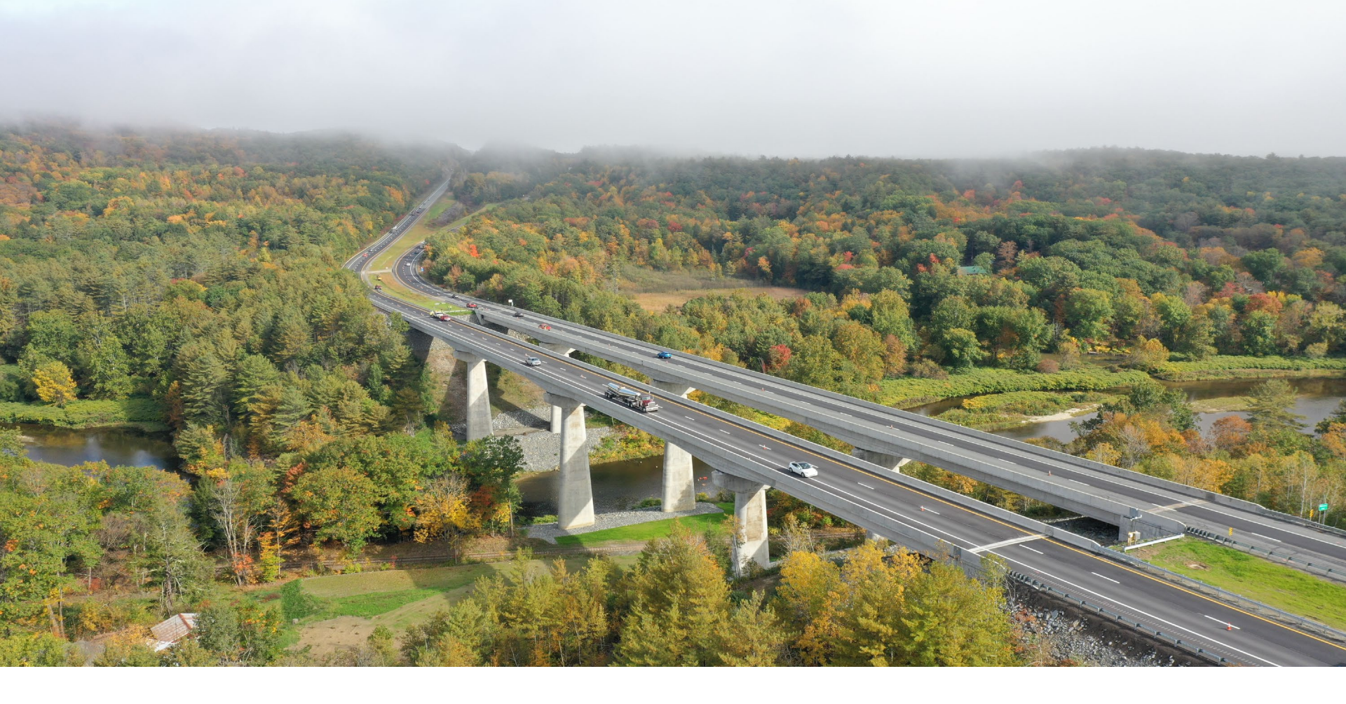
(Drone Picture of Completed Bridge – October 2021)