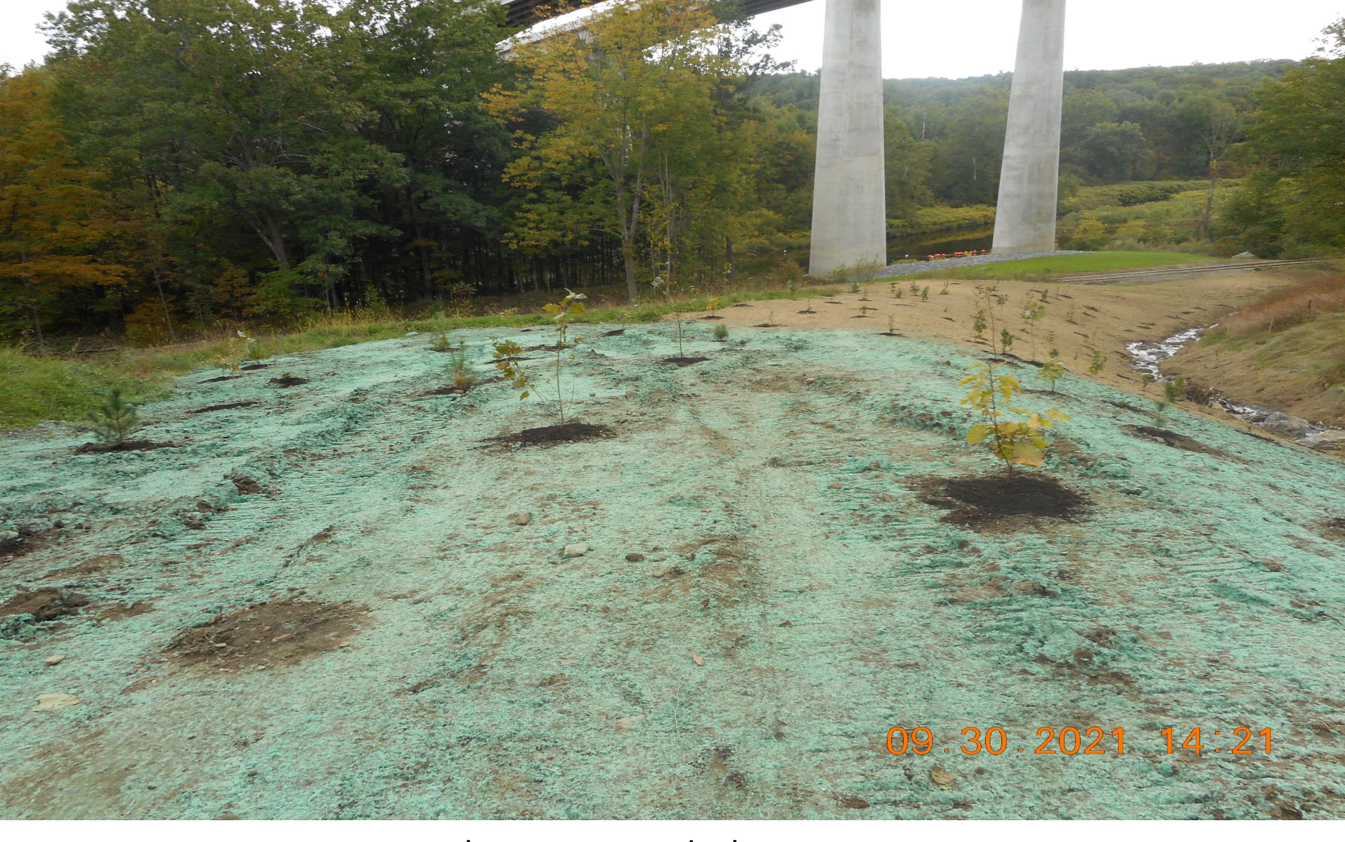
Tree Planting and slope vegetation