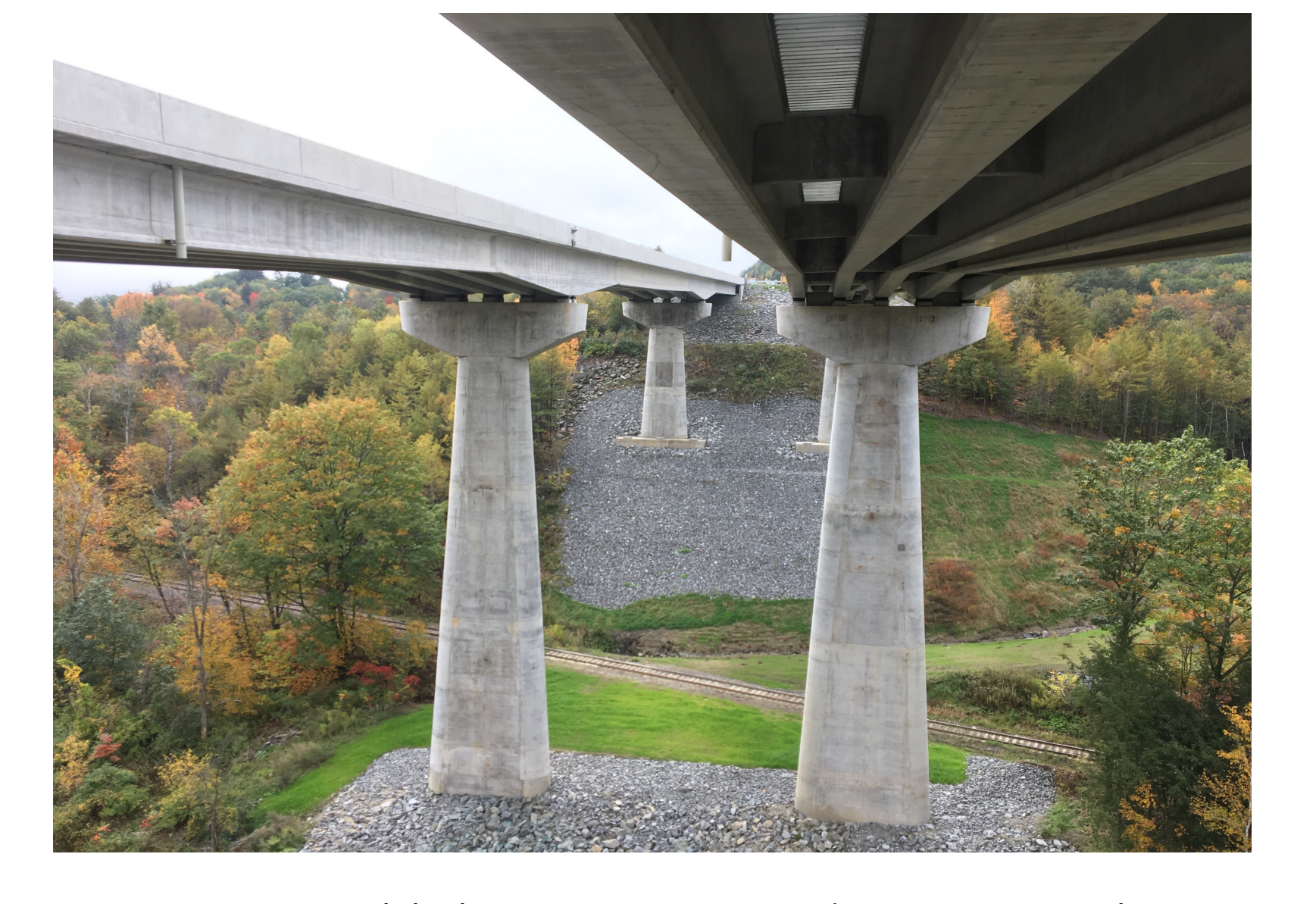
Re-establish Vegetation and Stream Bank Protection