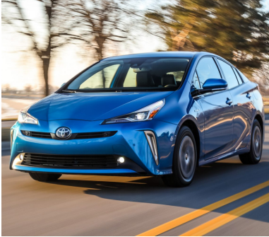
like the Toyota Prius