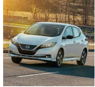
like the Nissan Leaf

"The MileageSmart program gave me the opportunity to get a newer car within my price range. This will hopefully result in more secure transportation for a longer time. It was an efficient, straight forward process. I am happy to get great gas mileage, too!"