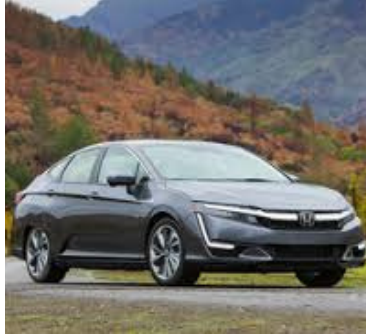
like the Honda Clarity