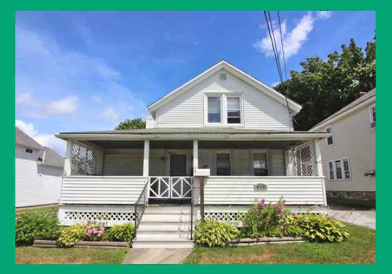
Recovery Housing, Bennington