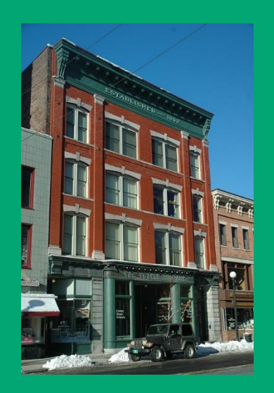
Tuttle Block, Rutland