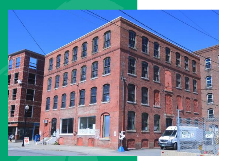
Flat Street, Brattleboro