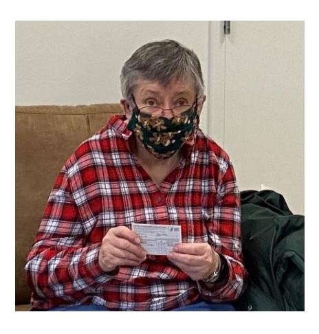
Above – A newly vaccinated SASH Participant

• Through SASH, RuralEdge hosted seven COVID-19 Vaccine clinics at our elderly buildings providing the vaccine to over 150 people and assisted with an additional clinic in Orange County.