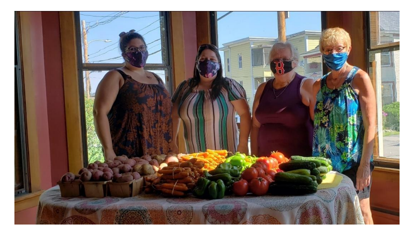
Above – SASH Coordinators and Nurses with produce for distribution

• RuralEdge has a very active SASH Program, with over 500 participants across the Northeast Kingdom. St. Johnsbury has multiple panels including an on-site Coordinator at Passumpsic View Apartments.