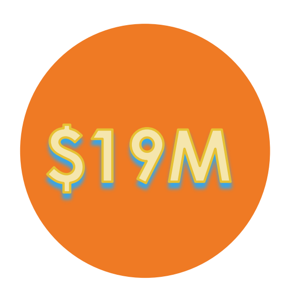
FFY22 FEDERAL BASE GRANTS