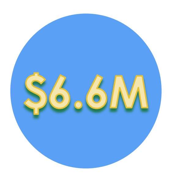
STATE MATCH SFY23 CW & DW (Base and Supplemental via IIJA)

Additional Sources: Carry forward funds from SFY 22 IUP: $TBD Repayments during SFY 23: Approximately $18M