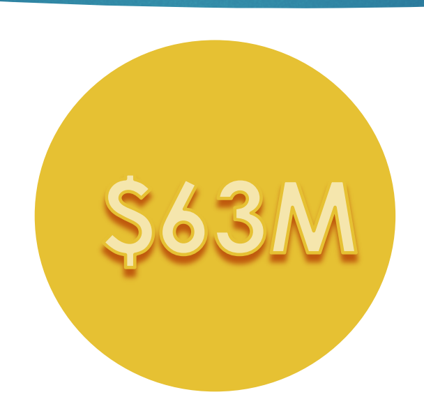
FFY22 FEDERAL SUPPLEMENTAL GRANTS