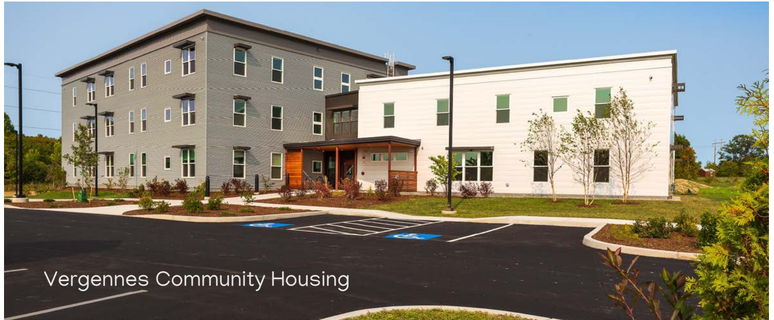
Vergennes Community Housing