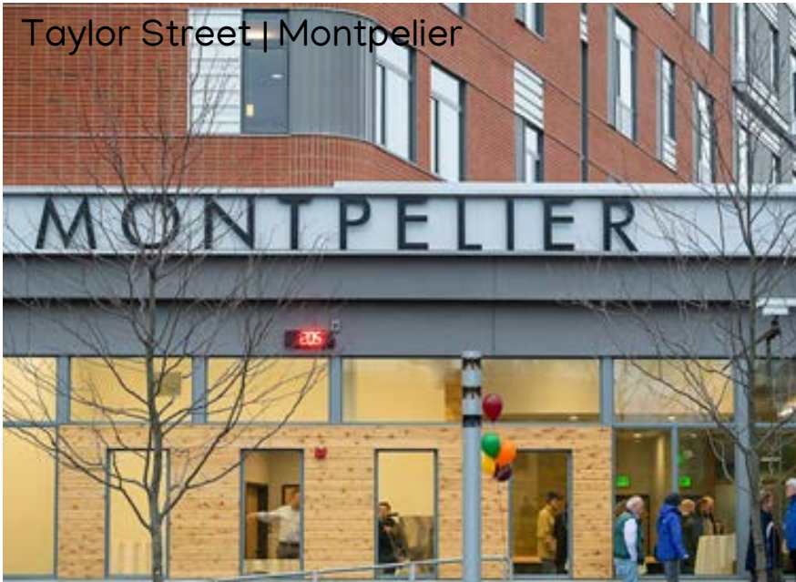
Taylor Street | Montpelier