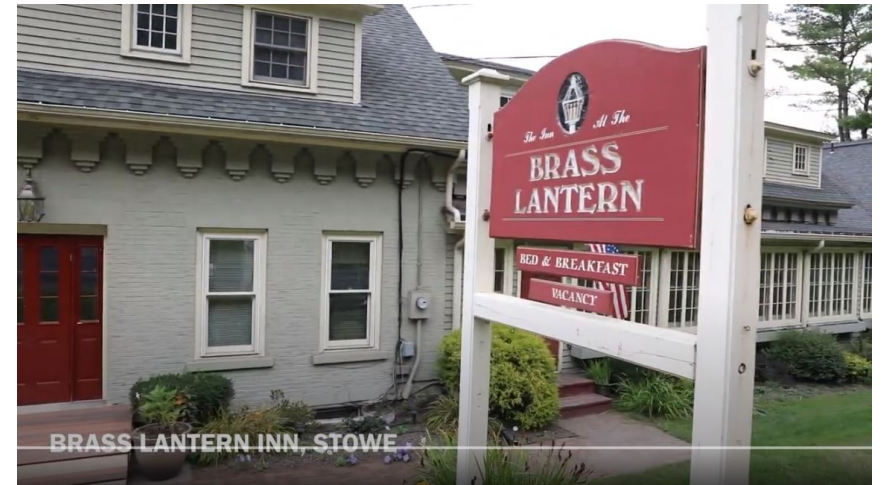
Brass Lantern Inn, Stowe [video link]