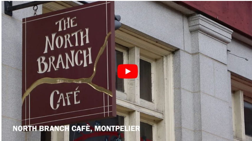
North Branch Café, Montpelier [video link]

Business owners from around the state have been supportive of the program, offering testimonials of their experience. Since the launch of the program, over 500 additional businesses have expressed support in being active participants should the program be funded to continue.