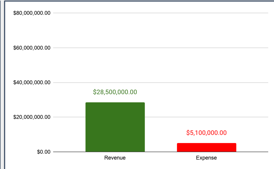
Captive Insurance Division*