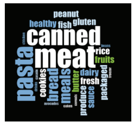
Figure 2. Food item Word Cloud based on the text search query.

Note: Although we did not ask about the specific pantry or food shelf respondents utilized, the Vermont Foodbank supports a network of 215 partner food shelves and meal sites in Vermont. The Vermont Foodbank is a member of the Feeding America national network.