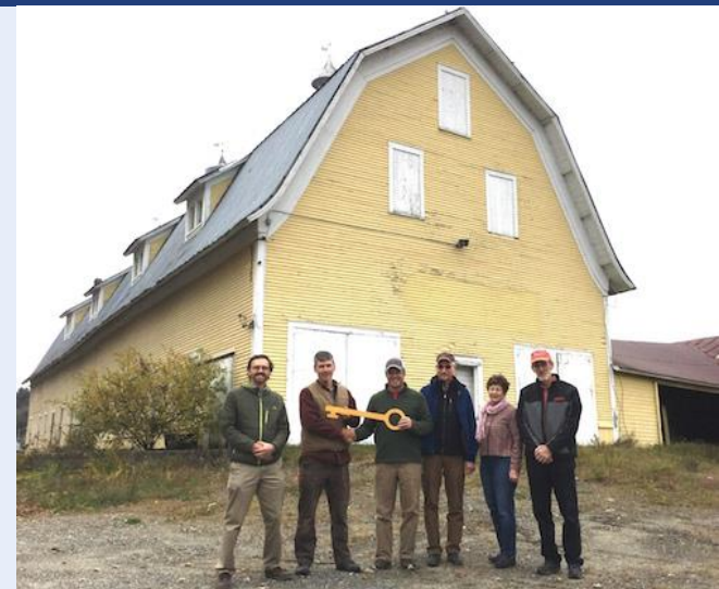
Yellow Barn Project, Hardwick $936,000 CDBG Implementation Grant