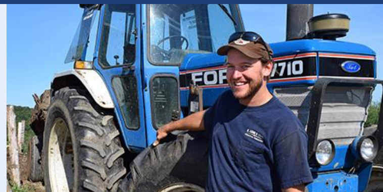
USDA RD Value Added Producer Grant to Sweet Rowen Farm ($114,000)