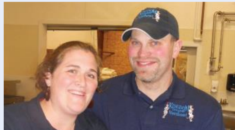
USDA RD Value Added Producer Grant to Kingdom Creamery of VT ($250,000)