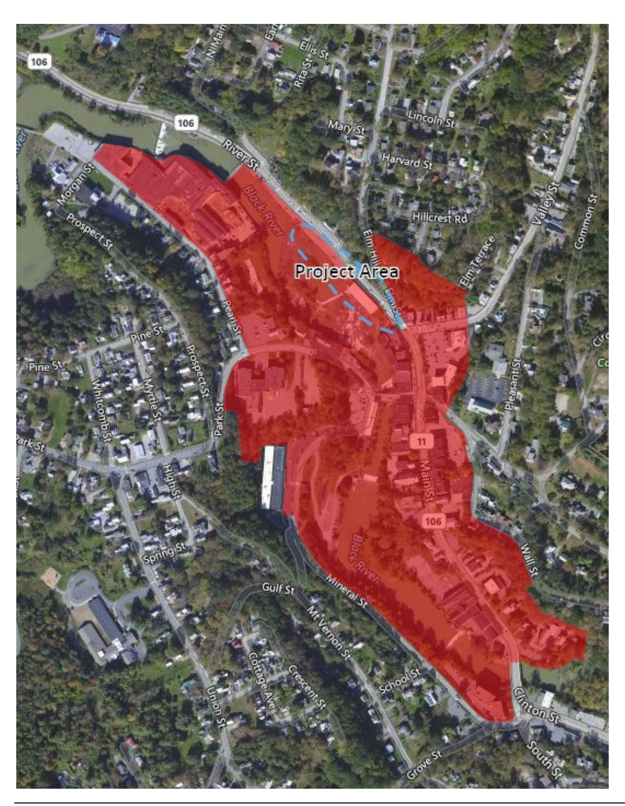
\label{eq:program} Program\ Description - 2022\ Downtown\ Transportation\ Fund - \textit{Page}\ 19 \ Vermont\ Department\ of\ Housing\ and\ Community\ Development