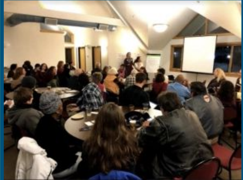
A pre-COVID community conversation in Newport, Vermont.