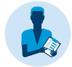
Disease Management and Adherence Initiatives