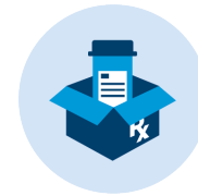
Mail-order/ Specialty Pharmacy