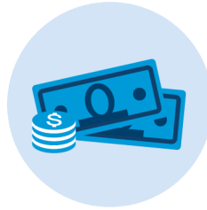
Price, Discount and Rebate Negotiations with Pharmaceutical Manufacturers and Drugstores