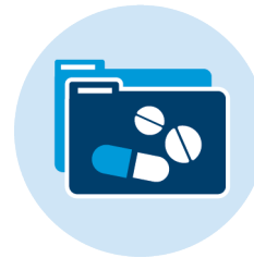
Drug Utilization Review