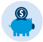
Value-Based Purchasing Program