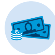
Negotiation of Rebates