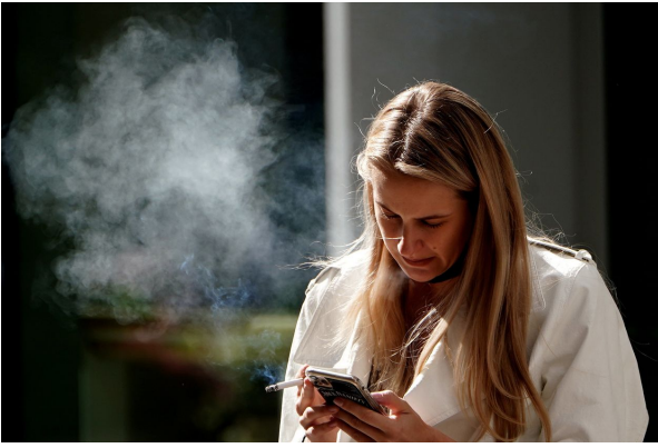
A woman smokes a cigarette while standing on Wall Street in New York City.